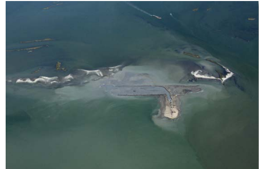
W8 Berm Operations – October 18, 2010