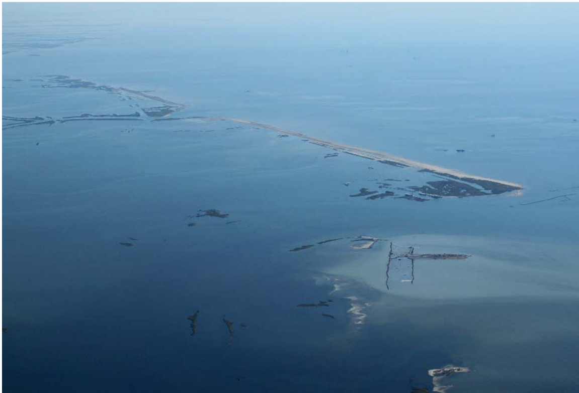
W8, W9, & W10 Berms – October 19, 2010

Shaw Environmental & Infrastructure Group