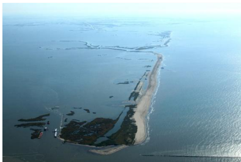
W9 Berm – October 13, 2010

Note: Under Construction represents linear footage of berm placed; all material may not yet conform to elevation +6.