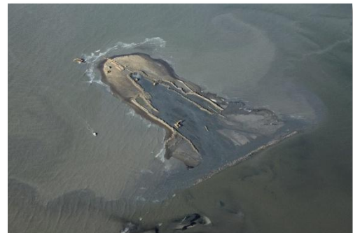
W8 Berm Operations – October 13, 2010