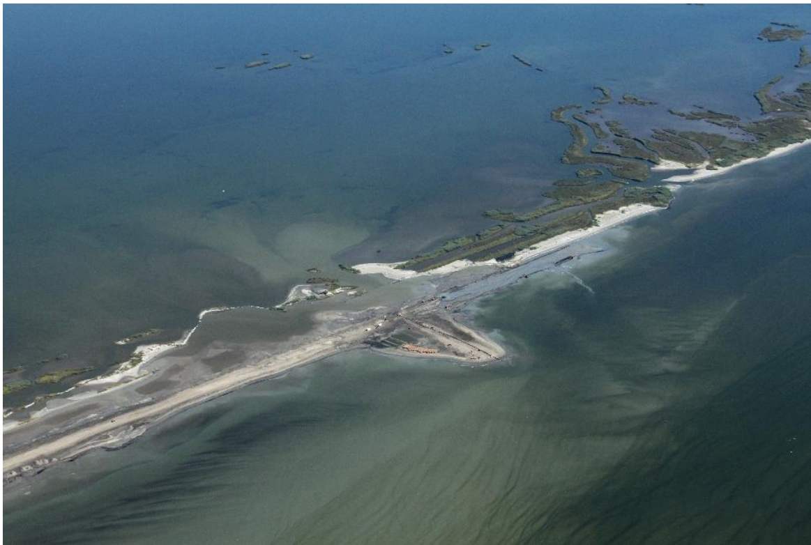
W10 Berm – October 17, 2010

Shaw Environmental & Infrastructure Group