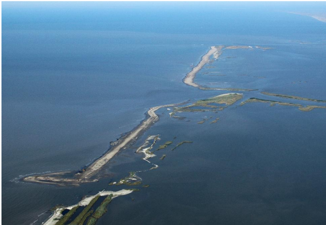
W9 & W10 – October 13, 2010

Shaw Environmental & Infrastructure Group