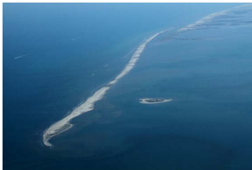
E4 North Berm – October 10, 2010

Note: Under Construction represents linear footage of berm placed; all material may not yet conform to elevation +6.