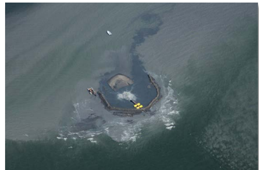
W8 Berm Operations – October 10, 2010