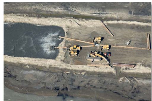
W10 Berm Operations – October 7, 2010