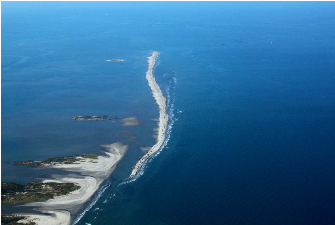
E4 North Berm – October 7, 2010

Shaw Environmental & Infrastructure Group