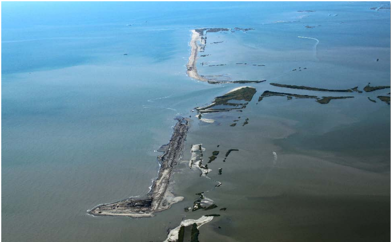
W9 & W10 Berm – October 7, 2010

Shaw Environmental & Infrastructure Group