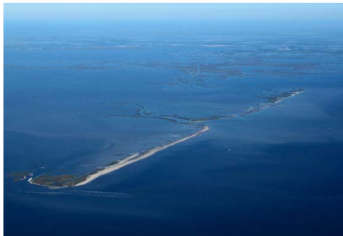
W9 & W10 – October 7, 2010

Note: Under Construction represents linear footage of berm placed; all material may not yet conform to elevation +6.