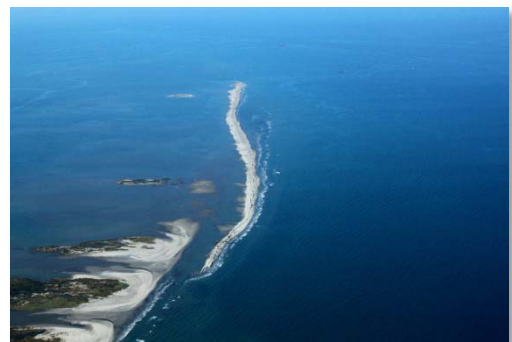
E4 North Berm Operations – October 7, 2010