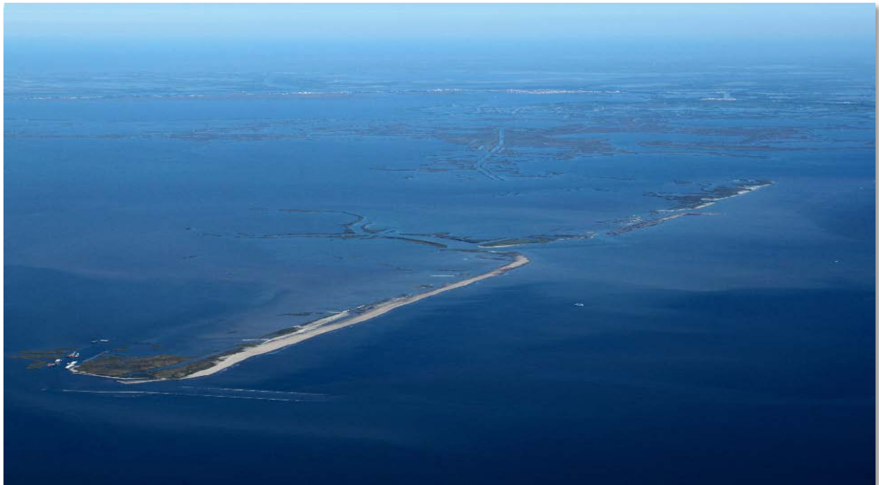
W9 & W10 Berm – October 6, 2010

Shaw Environmental & Infrastructure Group