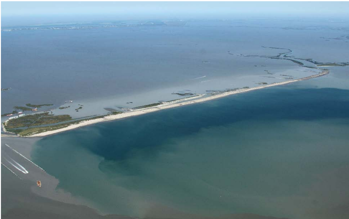
W9 Berm – October 3, 2010

Shaw Environmental & Infrastructure Group