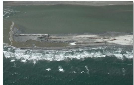
E4 North Berm Operations – October 3, 2010