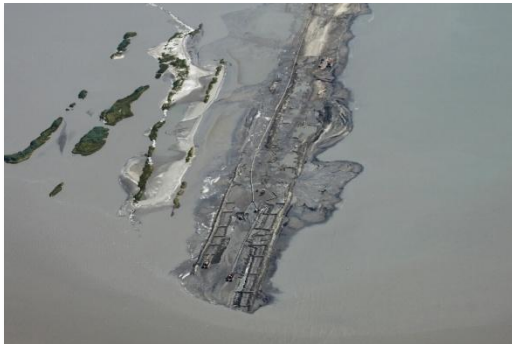
W10 Berm Operations – October 3, 2010

Note: Under Construction represents linear footage of berm placed; all material may not yet conform to elevation +6.