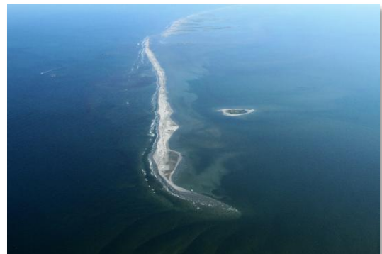
E4 North Berm – September 28, 2010