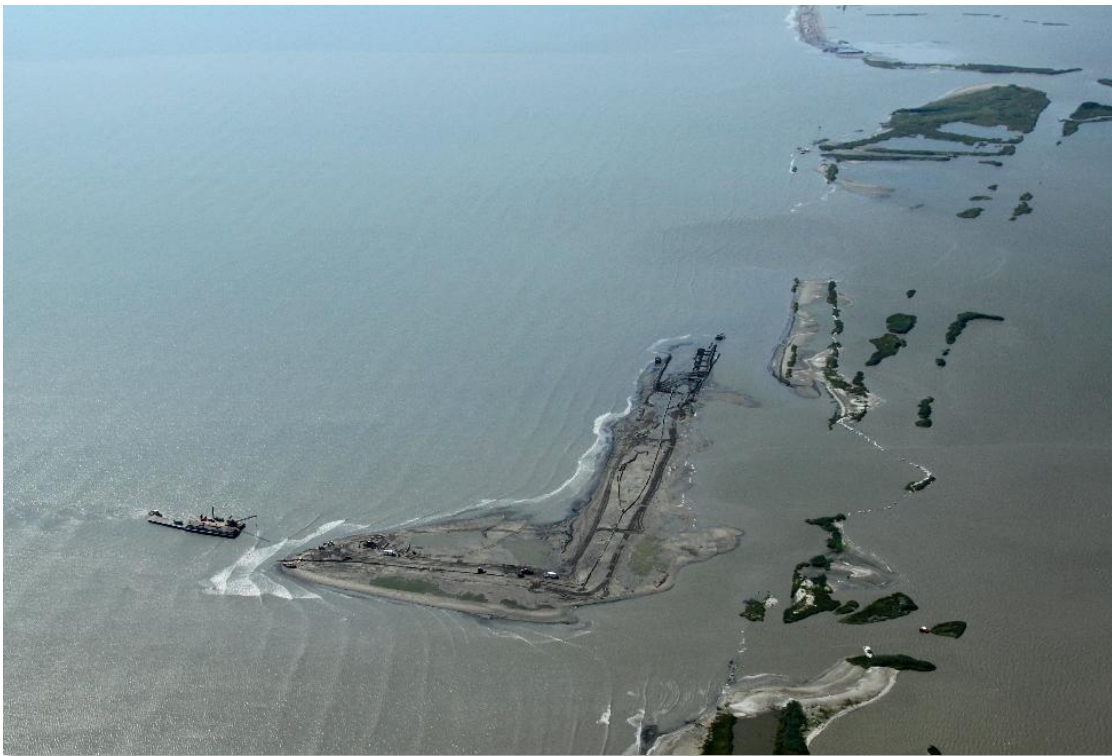
W10 Berm – September 28, 2010

Shaw Environmental & Infrastructure Group