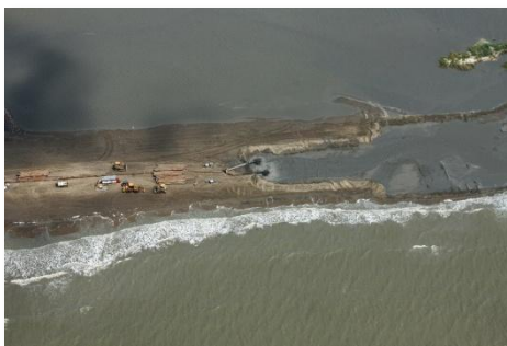
W9 Berm Operations – September 23, 2010

Note: Under Construction represents linear footage of berm placed; all material may not yet conform to elevation +6.