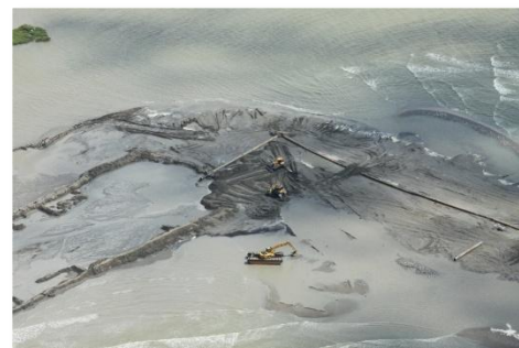
W10 Berm Operations– September 23, 2010