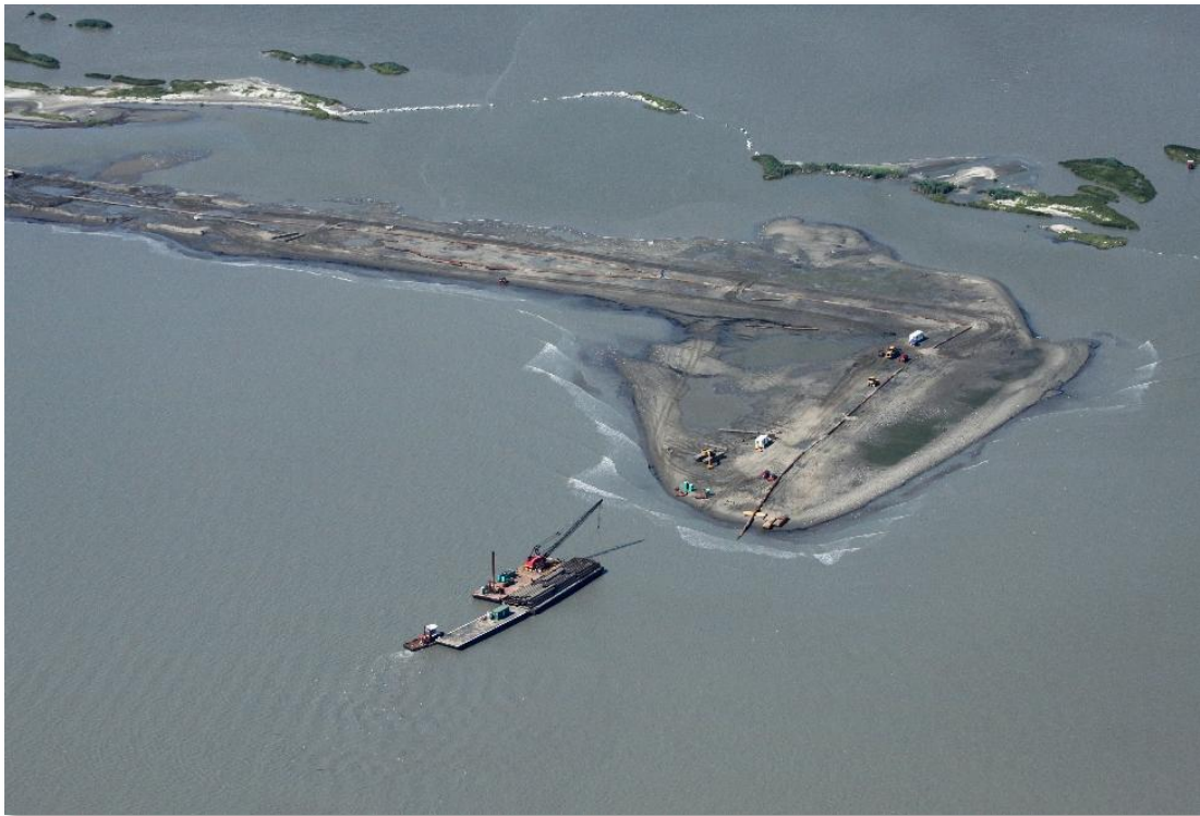
W10 Berm – September 28, 2010

Shaw Environmental & Infrastructure Group