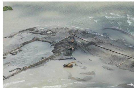
W10 Berm Operations – September 23, 2010