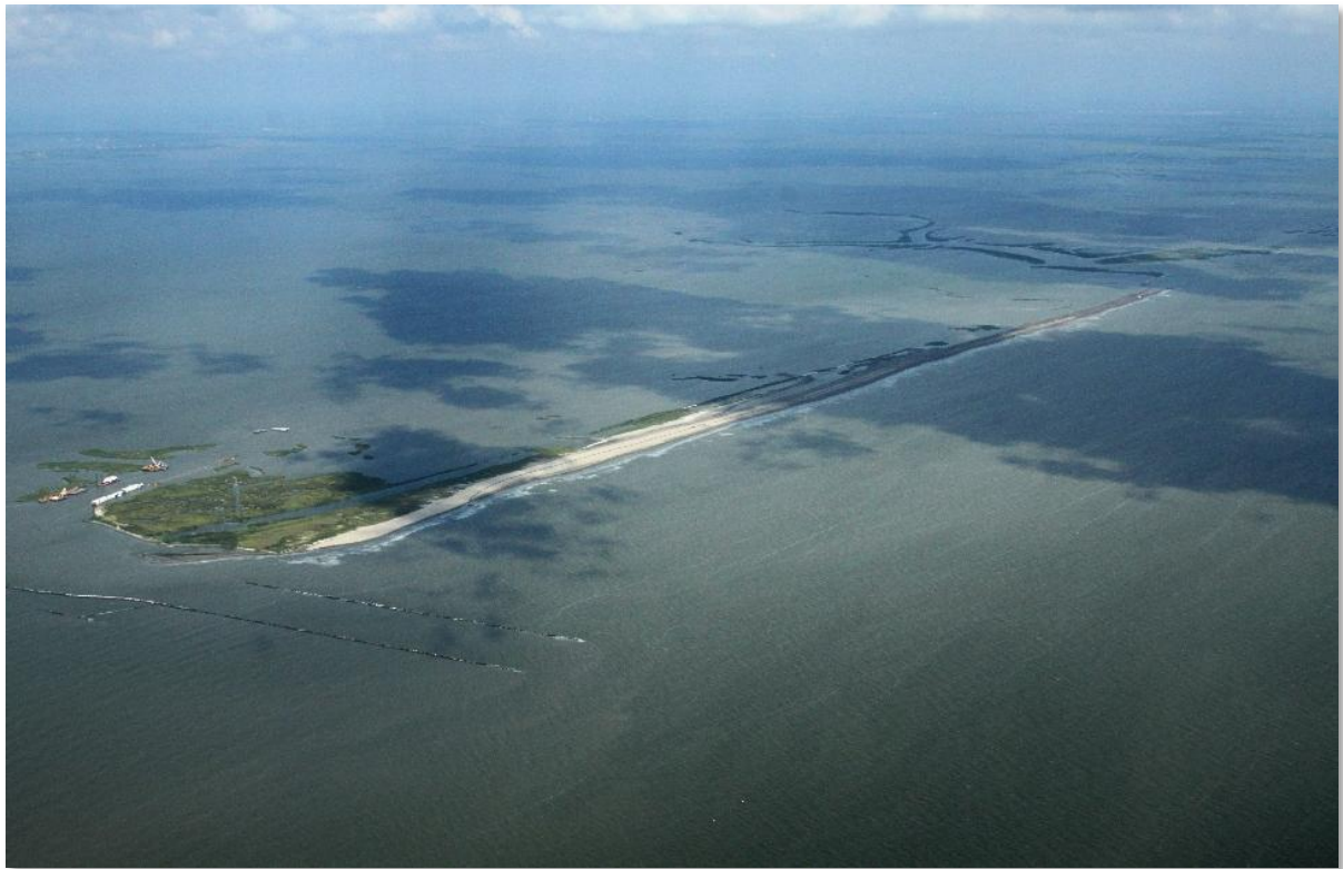
W9 Berm – September 21, 2010

Shaw Environmental & Infrastructure Group