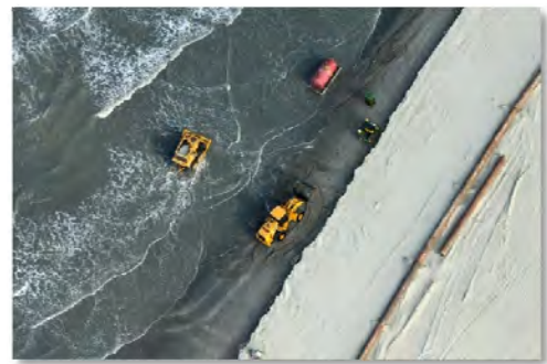
E4 North Berm – September 14, 2010