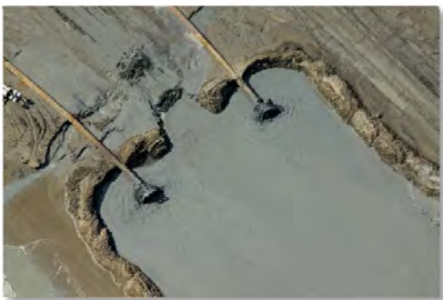
W9 Berm Operations – September 14, 2010

** Trended project completion quantities.