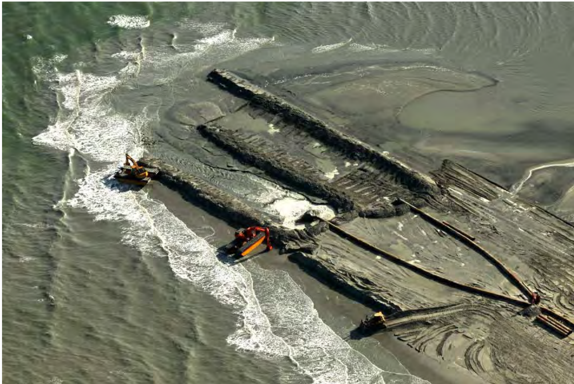
E4 North Berm – September 14, 2010

Shaw Environmental & Infrastructure Group