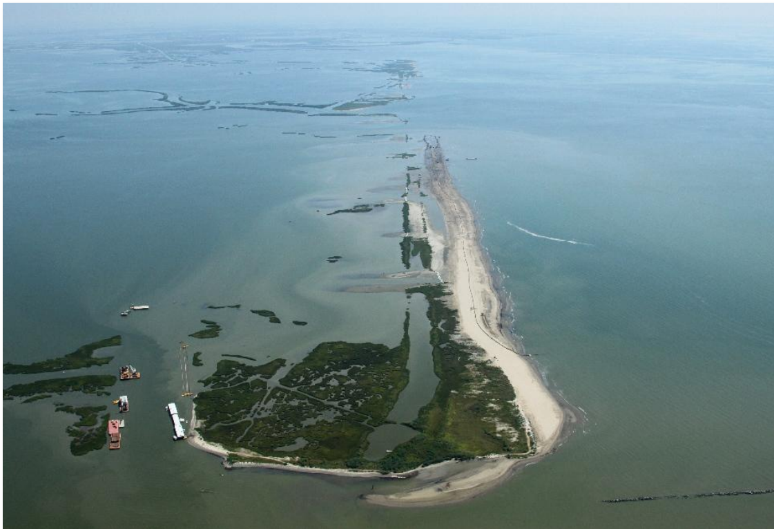
W9 Berm – September 14, 2010

Prepared by: Shaw Environmental & Infrastructure Group