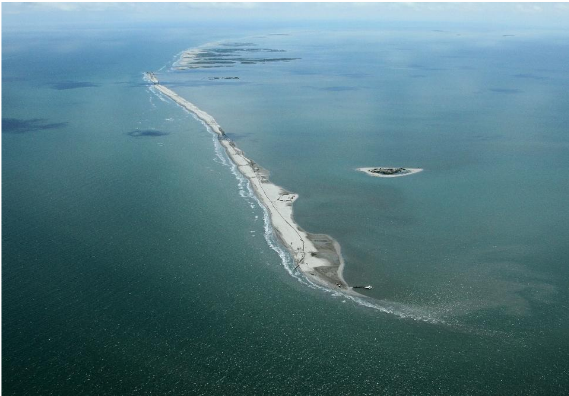
E4 North Berm – September 9, 2010

Shaw Environmental & Infrastructure Group