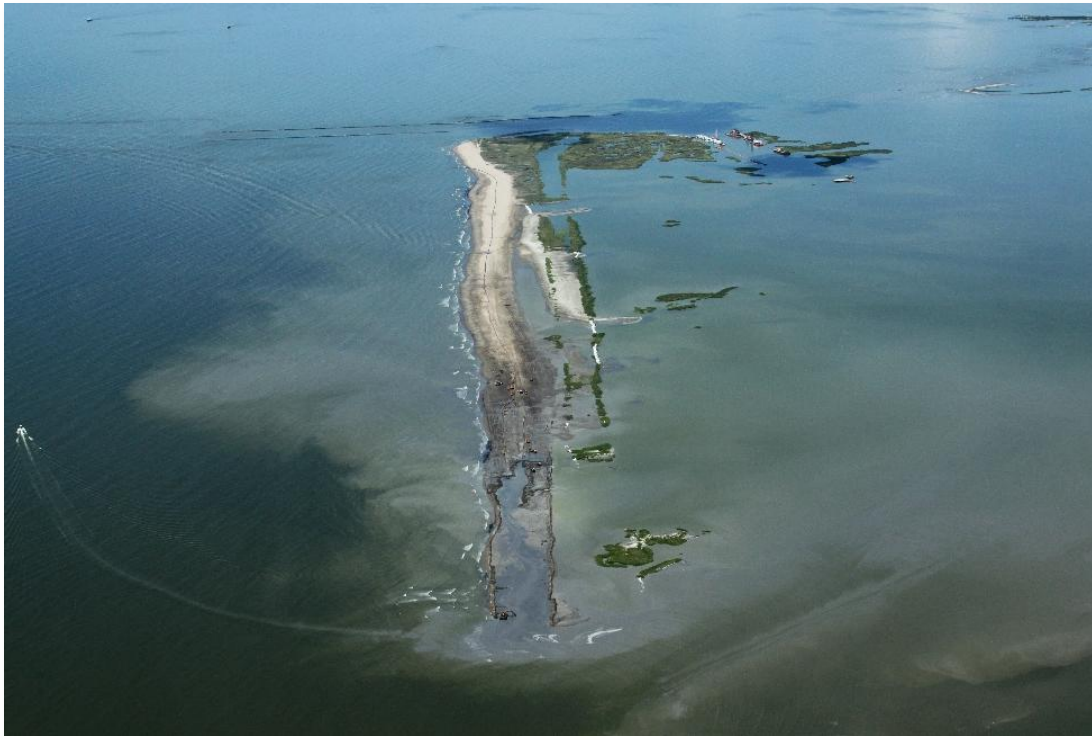
W9 Berm – September 9, 2010

Prepared by: Shaw Environmental & Infrastructure Group