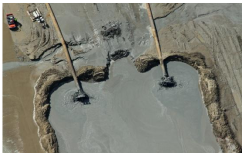
W9 Berm Operations – September 7, 2010

** Revised quantities based on project change control program.