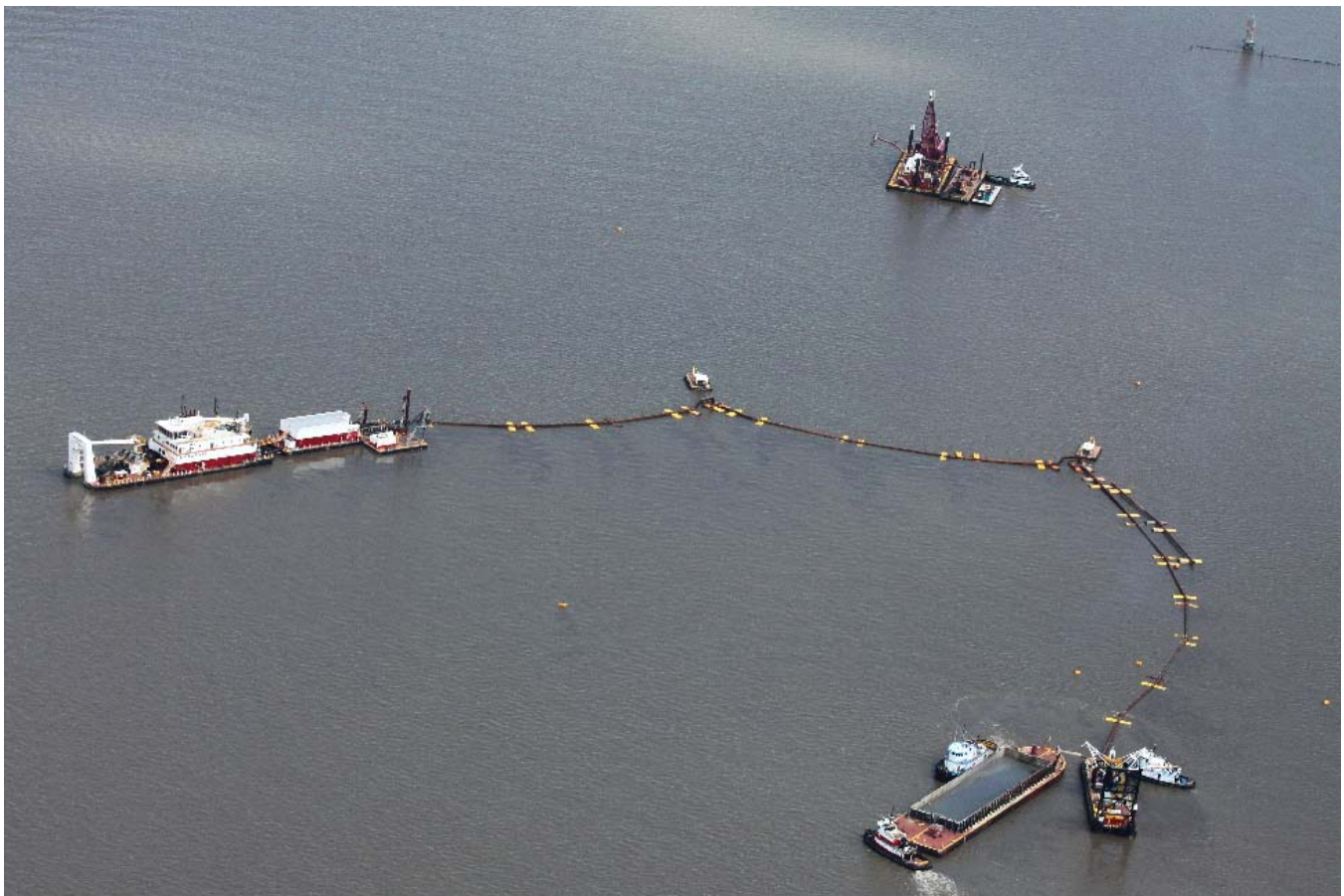
Pass A Loutre– July 27 th , 2010

Shaw Environmental & Infrastructure Group