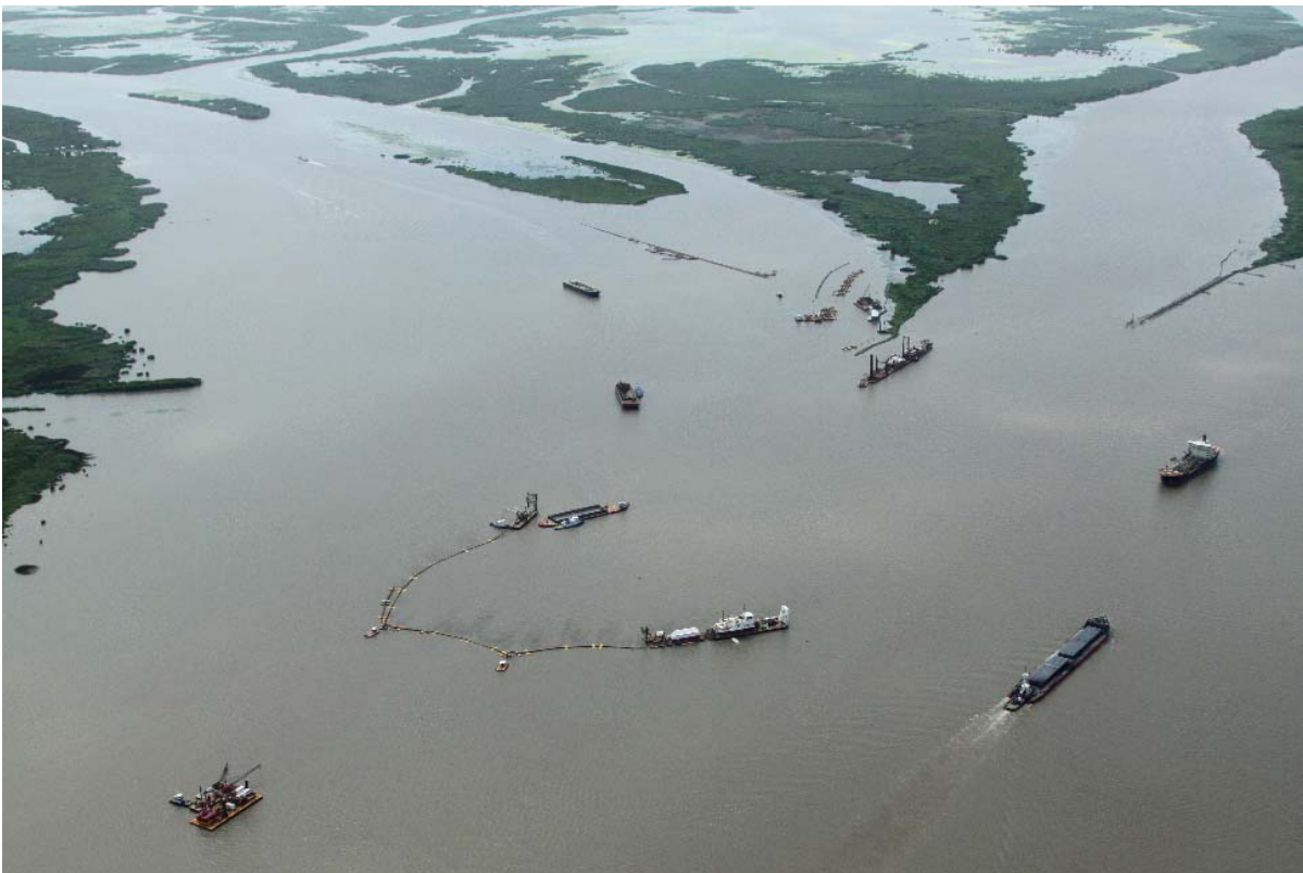
Pass A Loutre Aerial Photo - July 27, 2010

Note: Percent complete of material handled represents only 1 of 3 elements of percent complete for the overall project.