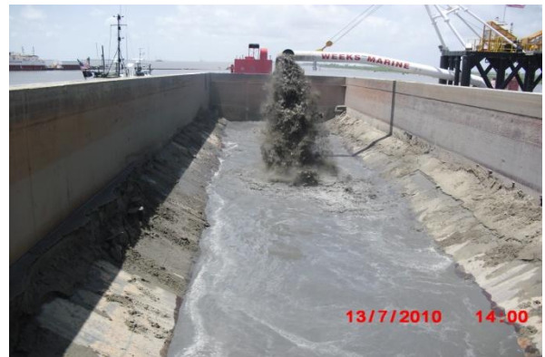
EW Ellefsen loading scow