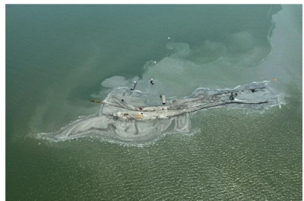
E4 Berm Aerial as of 7/13/10