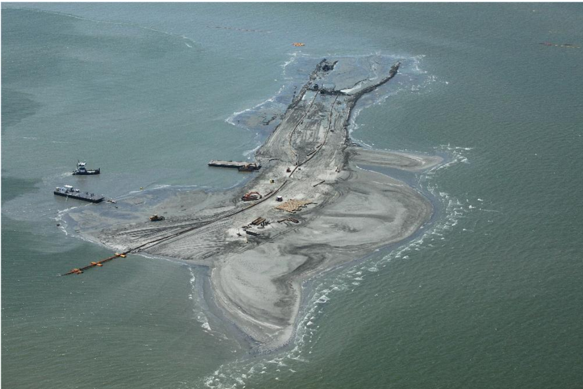
E4 Berm Construction – July 13, 2010

Prepared by: Shaw's Environmental & Infrastructure Group