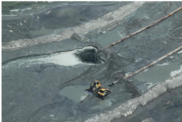
E4 Berm Construction

Note: Percent complete of material handled represents only 1 of 3 elements of percent complete for the overall project.