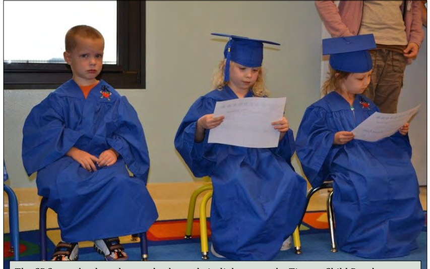
The CDC preschool graduates check out their diplomas at the Tieman Child Development Center's preschool graduation ceremony. The three children were the first graduating class of the CDC, which opened in late fall of 2010.

CDC offers services to children ages six weeks to five years of age and a summer program designed for school aged children. The center is accredited through the De-