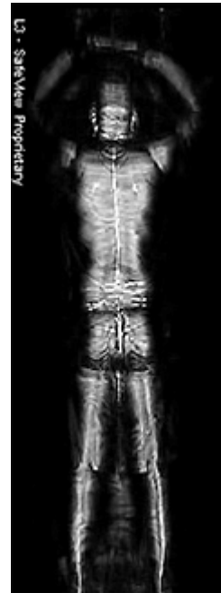
Millimeter wave image

While the equipment has the capability of collecting and storing an image, the image storage functions will be disabled by the manufacturer before the devices are placed in an airport and will not have the capability to be activated by operators. Images will be maintained on the screen only for as long as it takes to resolve any anomalies; if a TSO sees a suspicious area or prohibited item, the image will remain on the screen until the item is cleared either by the TSO recognizing the item on the screen, or by a physical screening by the TSO with the individual. The image is deleted in order to permit the next individual to be screened. The equipment does not retain the image. In addition, TSOs will be prohibited from bringing any device into the viewing area that has any photographic capability, including cell phone cameras. Rules governing the operating procedures of TSOs using this WBI equipment are documented in standard operating procedures (SOP), and compliance with these procedures is reviewed on a routine basis. Due to the sensitivity of the technical and operational details, the SOP will not be publicized, however, TSOs receive extensive training prior to operating WBI technology.