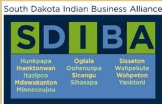
South Dakota Indian Business Alliance sdibaonline.org