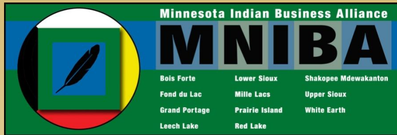
Minnesota Indian Business Alliance mniba.org