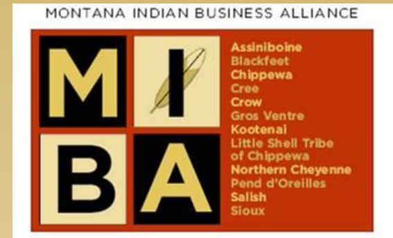
Montana Indian Business Alliance mibaonline.org