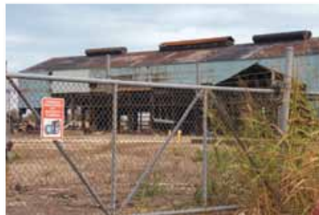
Emblematic of the old economy is the now-shuttered Green River Steel Co. plant. It is being razed.

The park would be re-created with a plaza named for McConnell, plus fountains, play areas, a waterfall, a hotel and an indoor "events center."