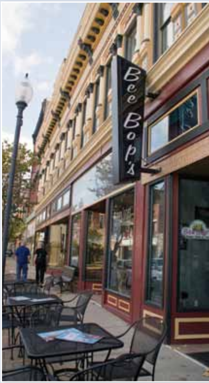
Not everything is new in downtown Owensboro. Many of the older buildings, some dating to the mid-19th century, have been renovated for second-level condos and street-level retail.