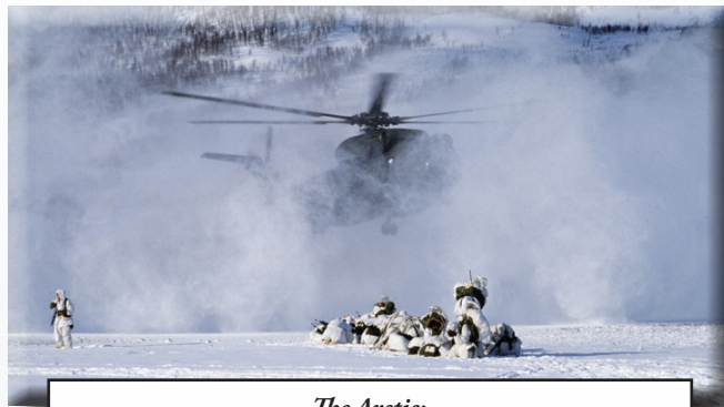
The Arctic: An emerging zone of cooperation

ARCTIC ZEPHYR. The ARCTIC ZEPHYR series, which started in 2010, seeks to expand understanding and awareness of the legal, security, commercial, and political ramifications of the changing Arctic environment, while strengthening relationships with other Arctic nations. The ARCTIC ZEPHYR exercise series will culminate in 2013, and remains one of the areas where we seek to find common ground and zones of cooperation with Russia.