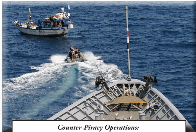
Counter-Piracy Operations: A Continuing U.S.-Russian Zone of Cooperation

Poland. Poland is a staunch supporter of U.S. strategic interests, theater operational initiatives, and NATO coalition operations, and serves as a critical leader of the newly acceded NATO nations. We welcome their engagement and deeply appreciate their expanded contributions to ISAF's mission in Afghanistan. In another area of critical importance, Poland's commitment to host regional ballistic missile defense assets is not only valuable to the United States; it contributes