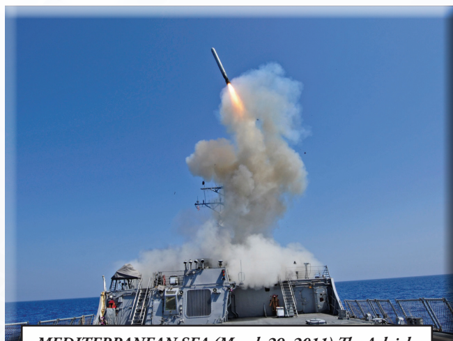
MEDITERRANEAN SEA (March 29, 2011) The Arleigh Burke-class guided missile destroyer USS Barry (DDG 52) launches a Tomahawk cruise missile in support of Operation ODYSSEY DAWN in Libya.

Libya Operations. Naval Forces Europe/Africa/C6F's posture and readiness were ideally suited to support Libya operations, wherein its forward naval bases—including Naval Air Station Sigonella, Italy and Naval Support Activity Souda Bay, Greece—played a vital role in