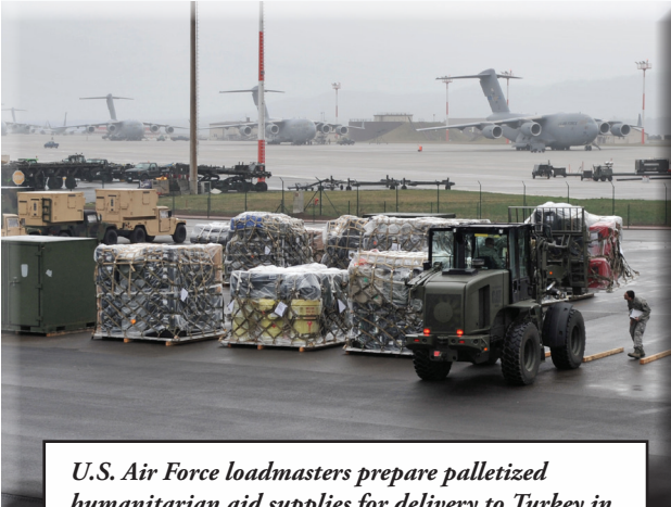
U.S. Air Force loadmasters prepare palletized humanitarian aid supplies for delivery to Turkey in the wake of last October's 7.2-magnitude earthquake in the northeastern part of the country. Theater air forces were essential in providing rapid disaster response to this important NATO Ally in its hour of need.

An instrumental global communications hub, Air Forces in Europe provides vital data links