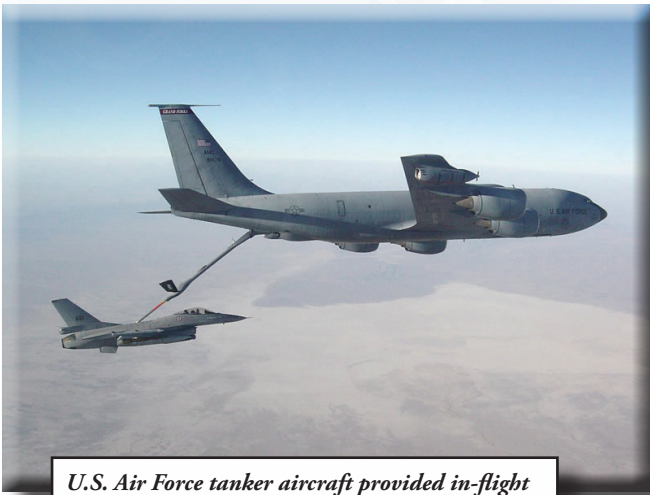
U.S. Air Force tanker aircraft provided in-flight refueling for coalition aircraft flying combat sorties in support of NATO Operation UNIFIED PROTECTOR.

Introduction & Overview. U.S. Air Forces in Europe provides forward-based, full-spectrum airpower and support to global U.S., NATO, and coalition operations. Air Forces in Europe provides mobility, access, communications, logistical support, contingency bed-down, command and control, and capable, responsive forces prepared to defend the homeland forward and respond at any time to crises across the theater or the world. This posture supports partnerships that enhance the NATO alliance and existing coalitions, ultimately increasing the security of the United States and reducing the burden on U.S. forces.