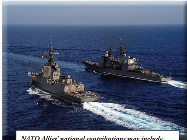
NATO Allies' national contributions may include surface combatants 'riding shotgun' to provide at-sea protection of U.S. Aegis BMD platforms.

At the November 2010 Lisbon Summit, NATO declared its commitment to develop a missile defense capability for the protection of NATO's European populations, territory, and forces. Supporting that effort, European Command has already fielded workstations employing the NATO-compatible U.S. BICES network throughout our headquarters and our Service Components' headquarters in order to provide a communication system able to support NATO's ballistic missile defense mission. This spring, European Command will add U.S. ships to the U.S. BICES architecture, further integrating our theater sensors, shooters, and platforms. There has also been a remarkable increase in the willingness of NATO nations to support the NATO ballistic missile defense mission through national contributions, such as protection (i.e. "riding shotgun") for Aegis Missile Defense platforms. European governments, including Spain, the United Kingdom, Germany, The Netherlands, Denmark, Italy, and France are examining ways to procure capabilities in order to complement EPAA and support this NATO mission.