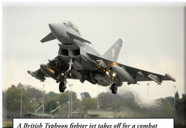
A British Typhoon fighter jet takes off for a combat mission over Libya during NATO's Operation UNIFIED PROTECTOR. NATO air assets conducted over 26,500 sorties to protect the Libyan people.

Libya. From March 24 to October 31, 2011, NATO Allies led an unprecedented coalition of contributors in Operation UNIFIED PROTECTOR supporting UN Security Council Resolutions 1970 and 1973. The coalition enforced an arms embargo by air and sea across Libya's maritime flank, maintained a no-fly-zone, and undertook specific operations to protect civilians and civilian populated areas. NATO air assets conducted over 26,500 sorties, including over 9,700 strike sorties to protect the people of Libya from attack or the threat of attack. A total of 49 ships from 12 nations, along with surveillance assets provided by submarines and maritime aircraft, supported the operation in the Mediterranean Sea. Ships conducted more than 3,000 intercepts for hailings, 311 boardings, and 11 denials. The NATO Alliance worked as it was designed to do, with our allies and partners sharing the burdens and responsibilities of these operational missions.