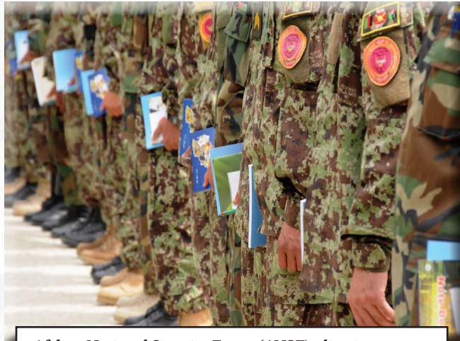
Afghan National Security Forces (ANSF) align in formation at the Capital Division Headquarters. ANSF continues to make sustained progress in training, professionalism, and literacy, driving positive change and feedback across the Afghan population.

By providing army and police trainers, as well as other forces, our European allies and partners have played an essential role in supporting this transition and maintaining the enduring partnership that follows. Europeans currently contribute approximately 25% of the mentoring teams required to train Afghan National Security Forces in the field, as well as gendarmerie and other instructor personnel serving at regional police training centers. Our European allies and partners understand the vital importance of this mission. They remain willing to send their sons and daughters into harm's way alongside the United States to bring peace, security, and prosperity to the people of Afghanistan. Their commitment also comes at a precious price, with nearly 1,000 forces killed in action and non battle-related deaths since 2001. In fact, many of these nations, making particularly large force contributions relative to their populations, are suffering proportionally higher casualties than the United States.