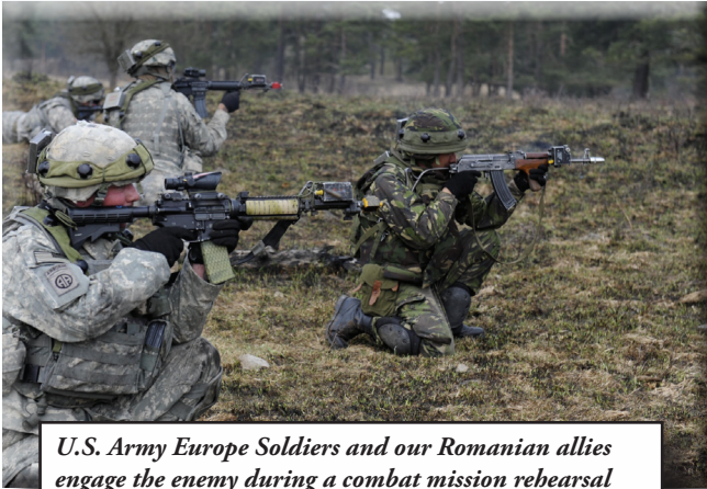
U.S. Army Europe Soldiers and our Romanian allies engage the enemy during a combat mission rehearsal exercise, conducted at the Grafenwoehr Training Area, Germany

Theater Security Cooperation. In one of European Command's most important Theater Security Cooperation initiatives, U.S. Army Europe forces prepared two Polish brigades, two Romanian battalions, and, in concert with the Marine Corps, two Georgian battalions for deployment to ISAF. Leveraging the personal relationships and consistent presence of our forward-deployed brigades, we use these brigades to conduct vital training and mentorship with similar multinational forces. These 'unit partnership' programs have dramatically