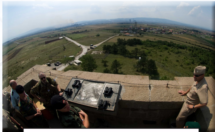
Admiral Jim Stavridis in Kosovo surveying the famous Field of Blackbirds, an ancient Balkan battle ground.

He holds various decorations and awards, including the Defense Distinguished Service Medal, the Defense Superior Service Medal and five awards of the Legion of Merit. He is author or co-author of several books on naval shiphandling and leadership, including Command at Sea and Destroyer Captain .