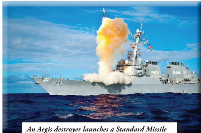
An Aegis destroyer launches a Standard Missile (SM)-3 in a Missile Defense Agency (MDA) test conducted with the U.S. Navy.

European Ballistic Missile Defense. Adversarial regimes continue to procure illicit ballistic missile technology, develop increasingly sophisticated missiles, and refine their abilities to employ these weapons against our forces, families, allies, and partners in Europe. Accordingly, European Command continues to plan and implement, in concert with our allies and partners, the European Phased Adaptive Approach (EPAA) to Missile Defense. Together with the Department of State, Department of Defense, Missile Defense Agency, and others, European Command is actively implementing the President's direction to defend Europe and America against the threat of ballistic missile attack.