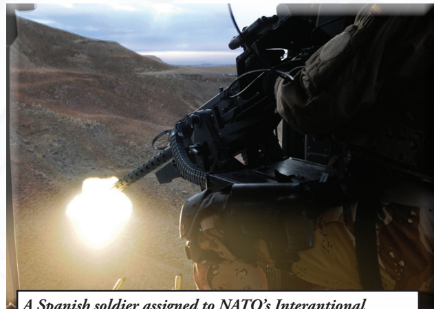
A Spanish soldier assigned to NATO's International Security Assistance Force (ISAF) conducts combat operations over northwestern Afghanistan. Spain has provided forces to ISAF for over a decade, since January, 2002.

Afghanistan. NATO's operation in Afghanistan remains the Alliance's most significant operational commitment to date. Our allies and partners continue to share the risks, costs, and burdens of ISAF. They have contributed troops, funding, and equipment, and have made significant non-military contributions to ISAF. ISAF forces include over 130,000 troops from 49 contributing nations. Three of the six regional commands in Afghanistan are led by allied or partner nations, and 13 of the 29 Provincial Reconstruction Teams in Afghanistan are led by nations other than the United States.