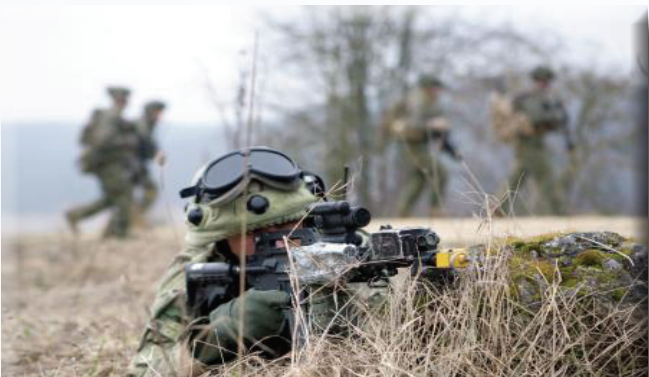
A Georgian soldier receives training through the Marine Forces Europe Georgia Deployment Program. The phase of training shown above was conducted at the Joint Multinational Training Center, Germany.

of four Georgian battalions to conduct full-spectrum counterinsurgency operations in support of ISAF. This program, the first of its kind in scale and scope, increased the Georgian Armed Forces' capacity to train and prepare their own forces for coalition operations, gradually decreasing U.S. Marine Corps instructor requirements by 60%. After working closely and building trust with the Marines through pre-deployment training and exercises—many conducted at the Joint Multinational Training Center in Germany—Georgia has extended its commitment to support U.S. Marine Corps operations in Regional Command-Southwest for another