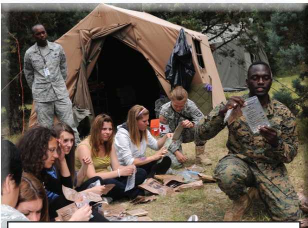
Theater forces conduct important relationship-building events through EUCOM's Partnership-for-Peace program, preserving and strengthening our strategic partnerships.

Relationships. Our experience in operating as part of multinational coalitions has demonstrated the importance of developing and sustaining long-term relationships with our allies