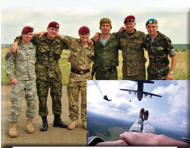
Paratroopers from (left to right) the U.S., Canada, the U.K., Belarus, Poland and Ukraine join together for a photograph to commemorate RAPID TRIDENT 2011, a first-of-its-kind multinational airborne exercise designed to promote regional stability and security, strengthen international military partnering, foster trust, and improve interoperability among participating nations. RAPID TRIDENT 2011 was led by U.S. Army Europe, and conducted at the International Peacekeeping and Security Center in Yavoriv, Ukraine.

Black Sea Exercises. Focusing on partnerships and interoperability in the Black Sea region, RAPID TRIDENT assembled 1,600 forces from 13 countries to conduct the first-ever multinational airborne drop into Ukraine, developing important land warfare skills and camaraderie among key NATO and non-NATO partners in a critical area of the world. JACKAL STONE 11, Special Operations Command Europe's annual capstone exercise, involved eight nations and over 1,500 partner nation Special Operations Forces (SOF) sharpening theater SOF capabilities in all mission sets from counterterrorism to high-intensity conflict. Exercise SEA BREEZE joined naval and marine forces from 14 countries in the Black Sea to exercise maritime interdiction, counter-piracy, non-combatant evacuation operations, and actions to counter