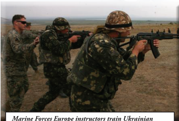
Marine Forces Europe instructors train Ukrainian soldiers on the firing range during their last cycle of counterinsurgency training before deployment to ISAF.

U.S. Marine Corps' Black Sea Rotational Force. The U.S. Marine Corps' Black Sea Rotational Force is a multi-year program rotating Marine air and ground units, based in the U.S., on deployment to bases in the Black Sea region in order to strengthen military capabilities, provide regional stability, and develop lasting partnerships with nations in this important region. In