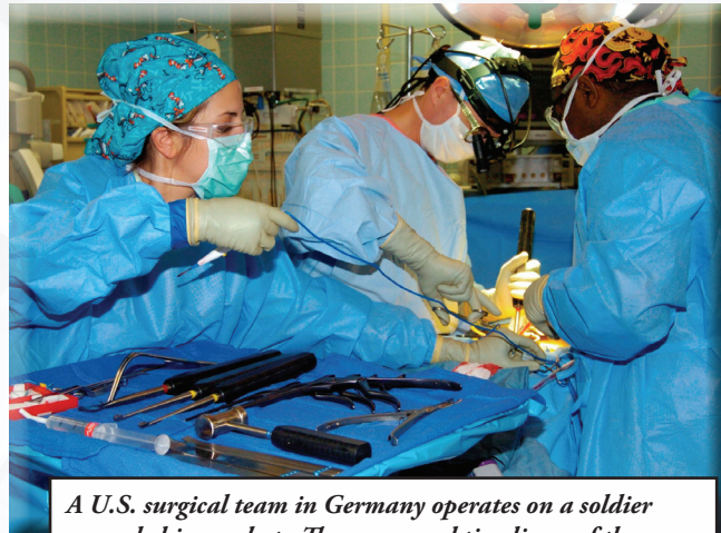
A U.S. surgical team in Germany operates on a soldier wounded in combat. The access and timeliness of these critical medical interventions have driven U.S. combat-related deaths to historic lows.

At other locations, we are optimizing the use of all available resources to ensure that these installations remain mission effective until they are removed from the inventory. Additional efforts to reduce inventory will be driven by future strategic force structure decisions. Though, in some cases, continued reductions and consolidations in the pursuit of increased efficiencies may require additional military construction in order to succeed.