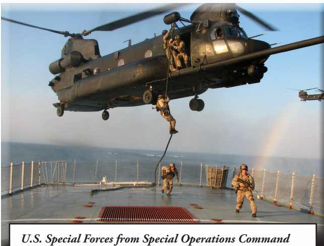
U.S. Special Forces from Special Operations Command Europe, alongside Romanian and Croatia SOF, conduct fast-rope insertion training from a Chinook helicopter onboard a ship at sea during Exercise JACKAL STONE 11.

annual JACKAL STONE Part 1 certification exercise, the command validated critical command and control and crisis response functions, while also exercising important capabilities during European Command's annual AUSTERE CHALLENGE exercise and executing mission support to Operation UNIFIED PROTECTOR.