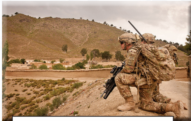
European Command is providing wide-ranging support to ISAF combat operations.

Some quantitative examples illustrate the scope of European Command's efforts to support the fight in Afghanistan. In Fiscal Year (FY) 2011, European Command conducted three Operational Mentor and Liaison Teams (OMLT) and three Police Operational Mentor and Liaison Team (POMLT) training rotations at the Joint Multinational Readiness Center in Grafenwoehr and Hohenfels, Germany, ultimately preparing 50 OMLTs, 25 POMLTs, and almost 2,000