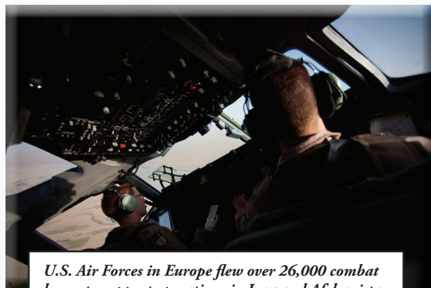
U.S. Air Forces in Europe flew over 26,000 combat hours to support operations in Iraq and Afghanistan with fighter and logistical aircraft, to include the resupply mission of this C-17 Globemaster III delivering supplies from Incirlik Air Base, Turkey, to Kandahar Air Field, Afghanistan, in August 2011.

Air Forces in Europe also made major contributions to operations in Afghanistan and Iraq. The command deployed a variety of aircraft to support combat operations, including fighter aircraft that provided multi-role and ground attack support as well as refueling aircraft, combat search and rescue, and operational support aircraft. In addition, personnel from across