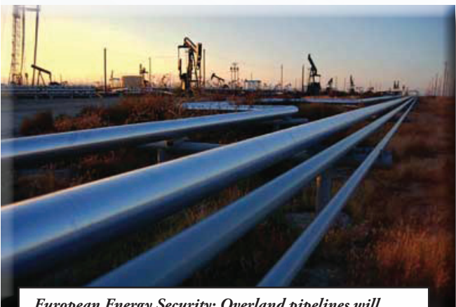
European Energy Security: Overland pipelines will continue to be an economic and political driver across European Command's area of focus.

across the European Command Theater, whether they are energy exporters, importers, or transit states. Dependence on natural gas from Russia will continue for many of our European partners, especially in light of its continued substitution for coal in electricity generation and questions regarding the future of nuclear power in Europe raised by the Fukushima nuclear incident. We continue to monitor changes to the energy status quo in Europe, including the large-scale development of shale gas and the increased utilization of liquefied natural gas.