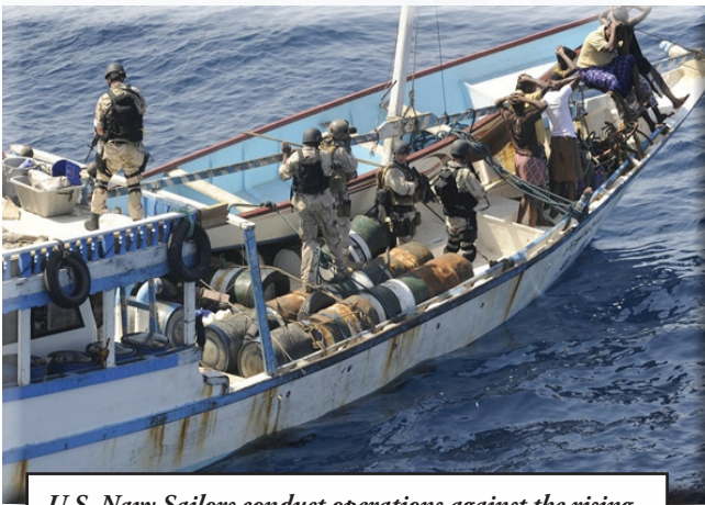
U.S. Navy Sailors conduct operations against the rising threat of international piracy which, by some estimates, costs the maritime shipping industry approximately $9B a year.

Introduction & Overview. U.S. Naval Forces Europe/Africa/Commander SIXTH Fleet (C6F), conducts the full range of maritime operations and Theater Security Cooperation in concert with NATO, coalition, joint, interagency, and other partners in Europe and Africa. Naval Forces Europe/Africa/C6F continues to perform Navy Component Commander functions supporting daily Fleet operations and Joint Maritime Commander/Joint Task Force Commander missions, thereby strengthening relationships with enduring allies and developing maritime capabilities with emerging partners, particularly in the theater's southern and eastern regions.