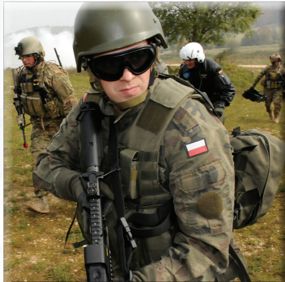
A Polish Special Operations Forces Command soldier, front, trains alongside U.S. Special Operations Forces at the Joint Multinational Readiness Center in Hohenfels, Germany.

personnel from 15 countries for deployment. Additionally, European Command conducted 21 Expeditionary Intelligence Training Program courses, providing fundamental counterinsurgency intelligence and operational skill sets for 628 personnel from 25 countries, and trained 2,135 soldiers from 18 countries in life-saving counter-IED skills. Finally, in 2011, European Command trained two Polish Brigades, two Romanian battalions, and two Georgian battalions for deployment to Afghanistan. All of these activities provide crucial linkages, personally and professionally, between the U.S. military and these deploying coalition forces. Without these relationships, contributions, and training conducted to a common standard, the challenges we face deployed side-by-side with these partners would be far more difficult, and the requirements placed on U.S. forces heavier.