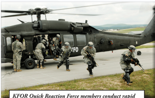
KFOR Quick Reaction Force members conduct rapid response training. Kosovo remains a focus area to preserve and protect long-standing security gains.

U.S. engagement in Kosovo remains focused on the objectives outlined in the NATO-endorsed Ahtisaari Plan, calling for development of Kosovo Security Force (KSF) capacity in specialized skill sets including Explosive Ordnance Disposal, hazardous material response, firefighting, search and rescue, and other supporting functions. The