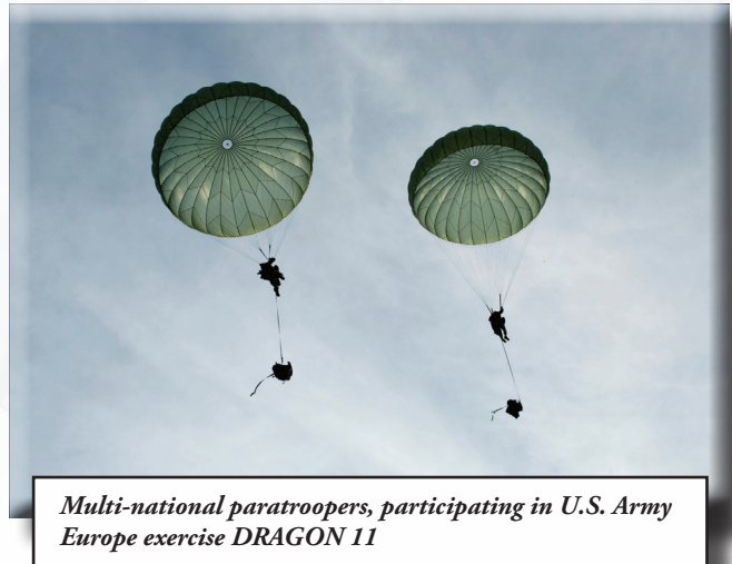
Multi-national paratroopers, participating in U.S. Army Europe exercise DRAGON 11

• DRAGON 11, a live-fire exercise conducted in Poland with Polish, Canadian, and British ground forces to enhance partner capacity and increase interoperability. The exercise incorporated ISAF lessons learned, through the participation of NATO Multinational Corps Northeast (MNC-NE) personnel and the 173rd Airborne Brigade Combat Team.