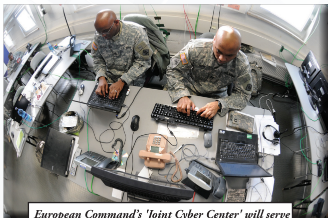
European Command's 'Joint Cyber Center' will serve to organize, coordinate, and integrate cyberspace activities, synchronizing them with operations in the traditional warfighting domains.