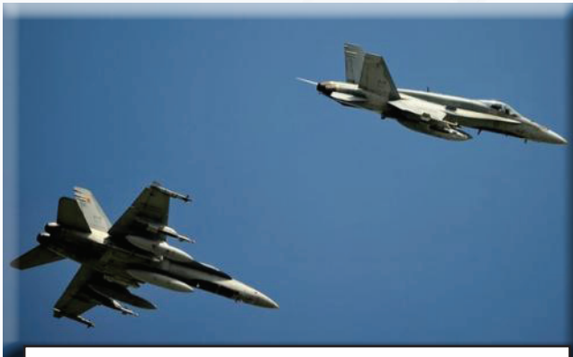
Canadian F-18 jet fighters deployed from European bases to conduct combat sorties over the skies of Libya in support of NATO's Operation UNIFIED PROTECTOR.

This support made it possible to develop a holistic basing plan that maximized the air assets of all participating nations, and provided the aircraft support, logistics, ordnance, communications, and resupply to ensure rapid and sustained actions throughout the operation.