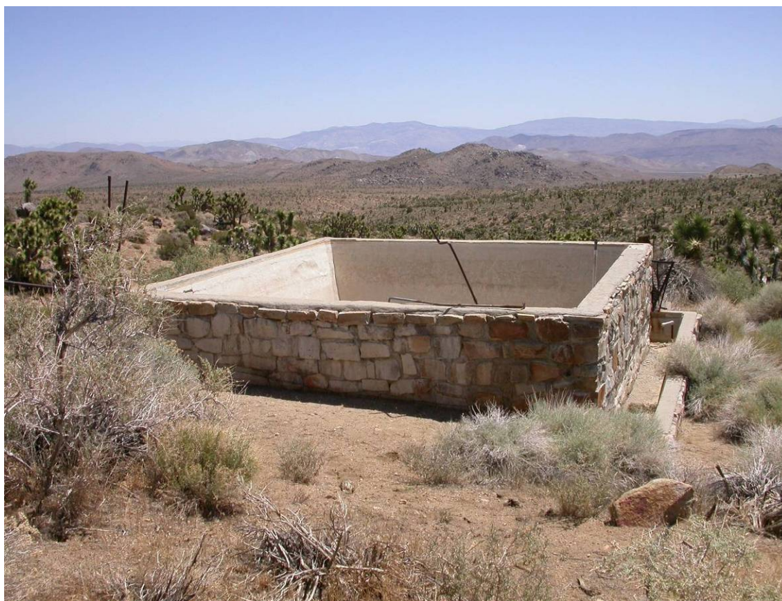
Figure 4-1. Crystal Springs Stock Water Tank, view to east.

The Crystal Springs site consists of a masonry stock water tank measuring 18x18x6 ft. The tank was made with locally quarried stone. A pipe between the Crystal Springs and the tank was buried one foot underground to prevent freeze damage to the line during the winter. A corral was located approximately 110 feet to the east of the stock tank. The corral, measuring approximately 15x30 ft, was constructed of milled lumber, tree branches, live trees, and metal stakes using double twisted, double tied barbed wire. An earthen overflow reservoir, metal trough, bed frames, glass fragments, metal cans, and flaked stone debitage were also recorded at the site. The site is surrounded by a five strand barbed wire fence. The Crystal Springs stock tank was constructed by the CCC at the request of the Division of Grazing in Reno, Nevada from 4 December 1939 – 15 March 1940. It was used as a gathering point for stock traveling on the trail to Owens Valley. The e 2 M team evaluates the site as locally significant under criterion A for its association with the CCC. The site has retained its historic integrity, and is recommended here as eligible for NRHP listing.