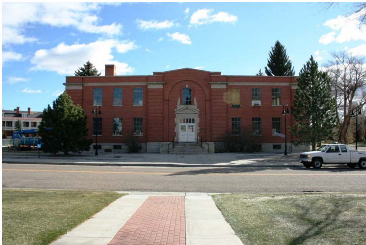
Figure 4-2. Base Gym, Building 151, view to east