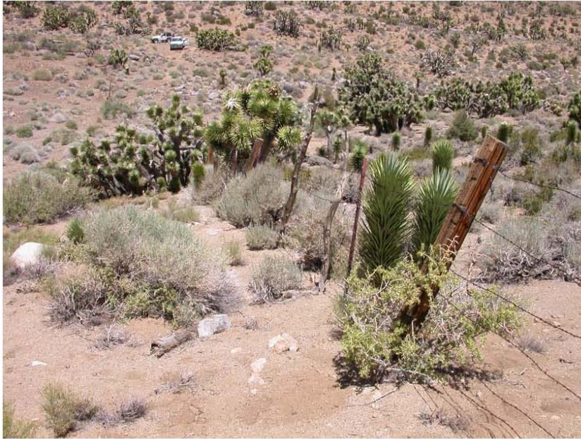
Photo #5 Fence line surrounding the site at Crystal Spring. View to the north.