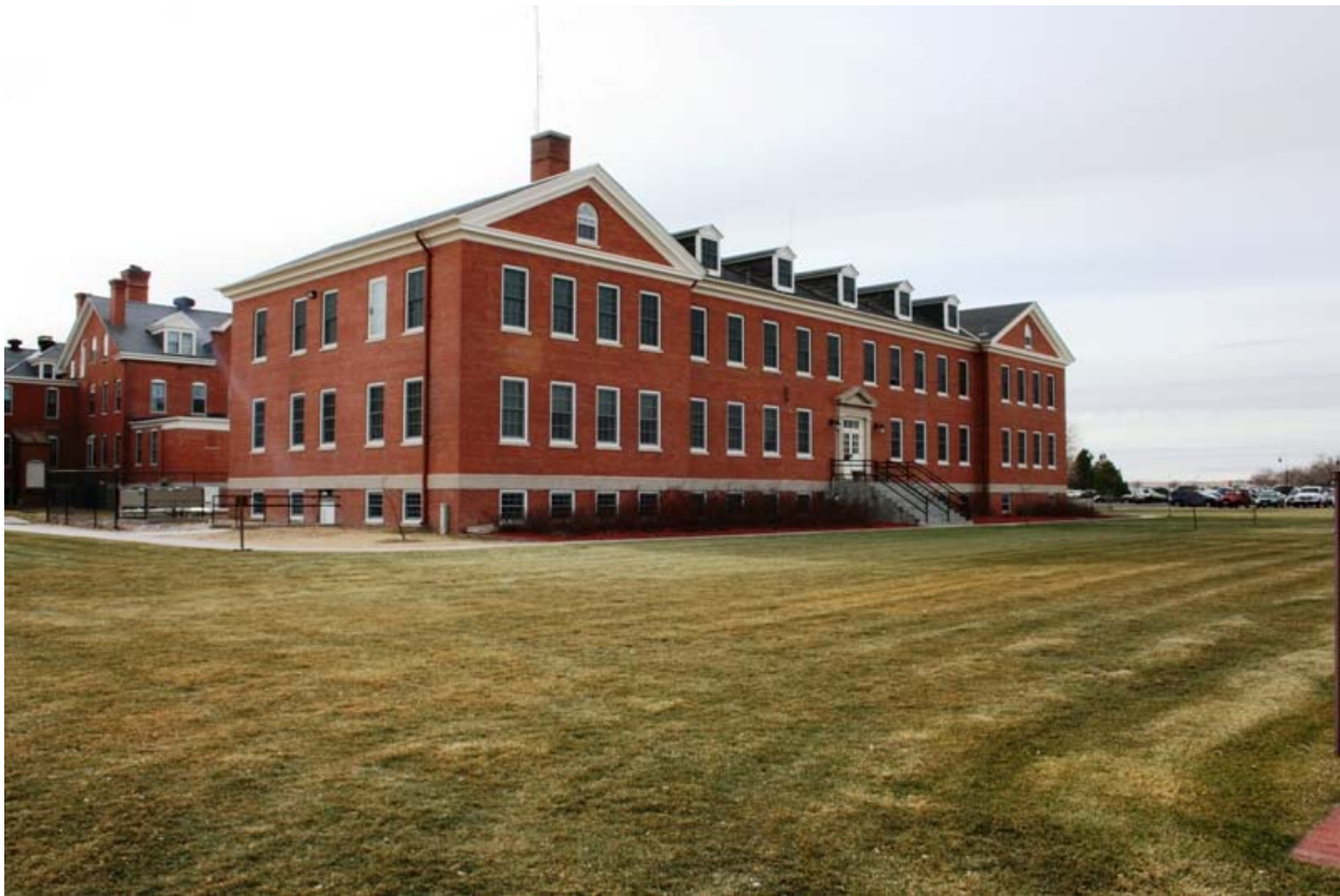
Figure 4-3. Medical Detachment Barracks, Building 152, view to southwest