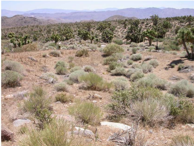
Photo #6. Overflow reservoir at Crystal Spring. View to the south.