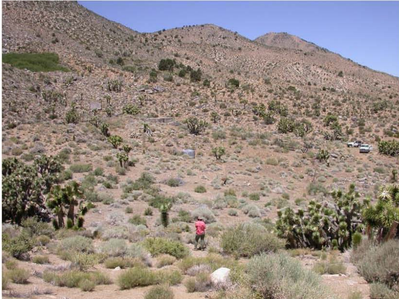
Photo 1. Overview of the site looking towards the north. Crystal Spring is in the top left corner.