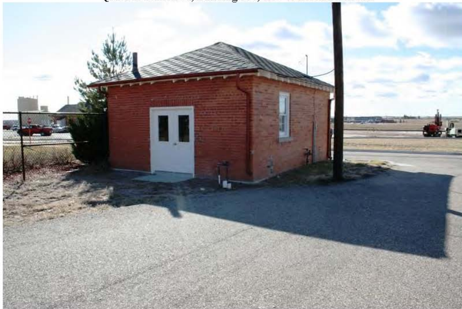
QM Gas Station #1, Building 364, view to south southeast