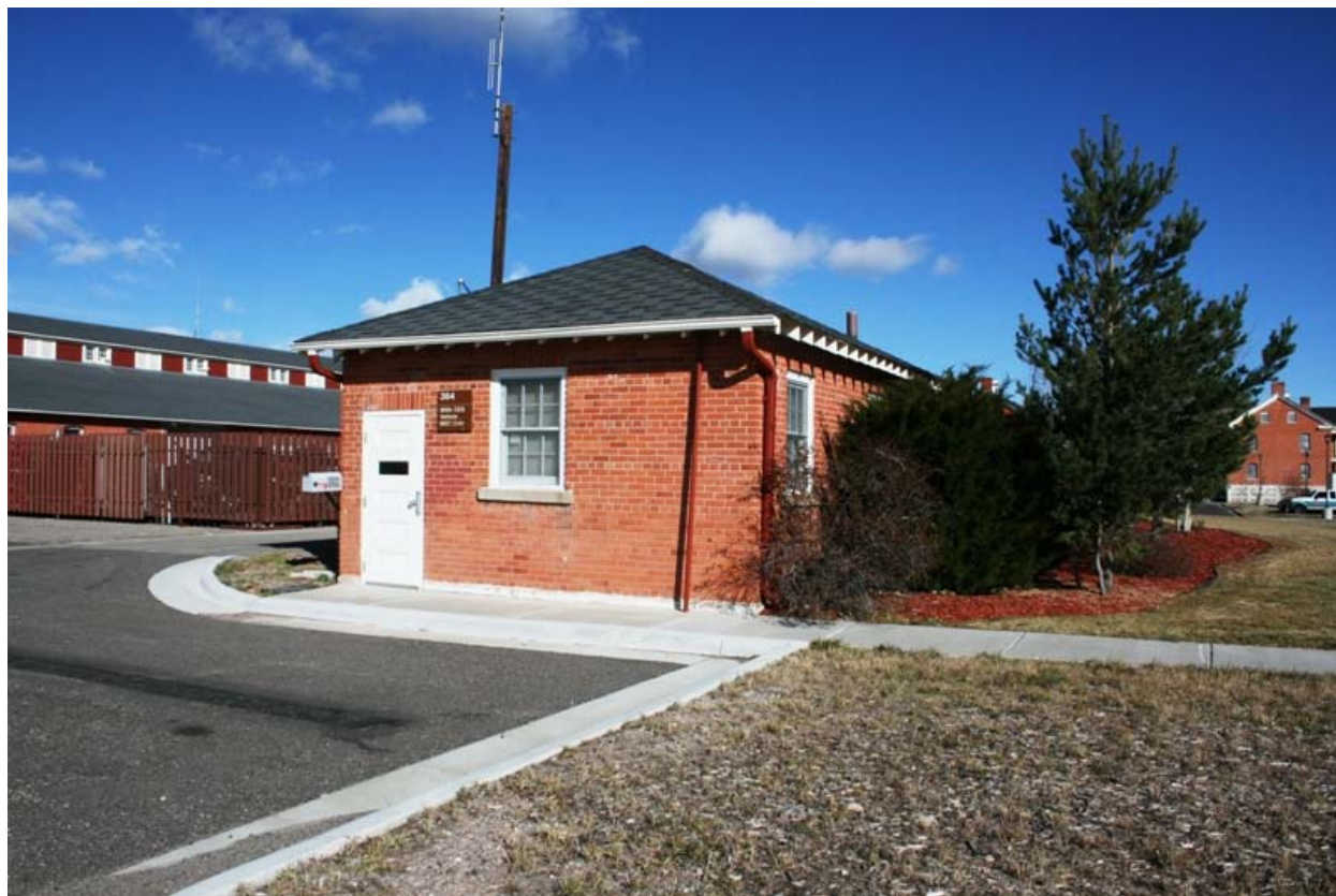
Figure 4-6. Quartermaster Gas Station #1, Building 364, view to north northwest