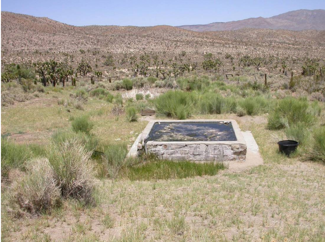
Figure 4-4. China Garden Springs Tank, view to east.