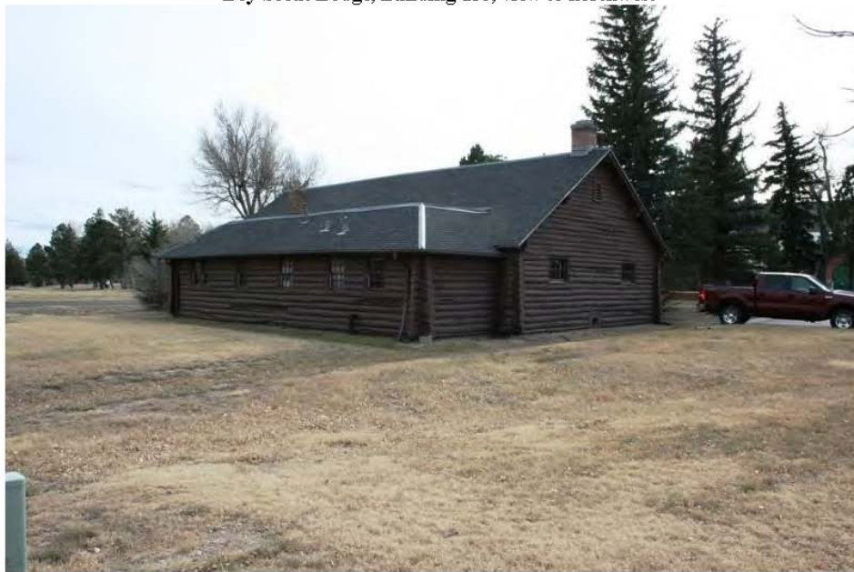
Boy Scout Lodge, Building 153, view to southeast