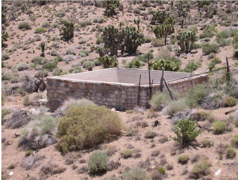
Photo #3, View of the CCC stock water tank looking towards the south.