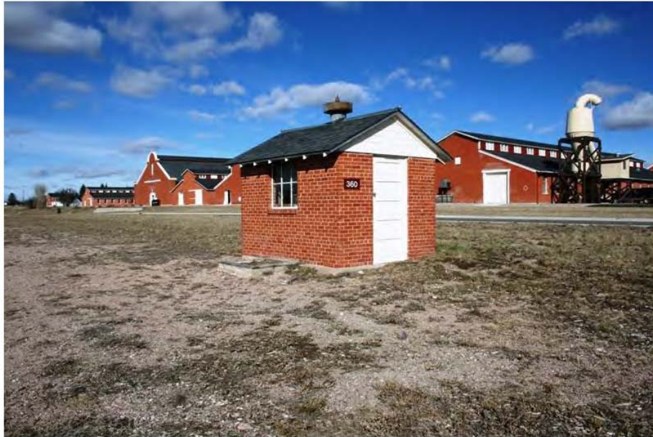
Gas Valve Facility, Building 360, view to northwest