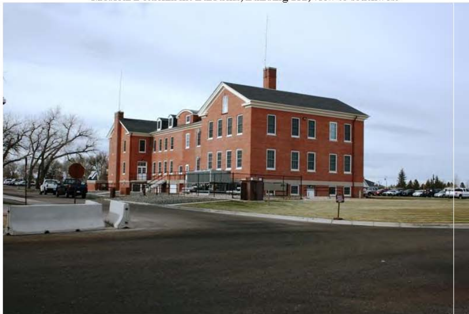
Medical Detachment Barracks, Building 152, view to northwest