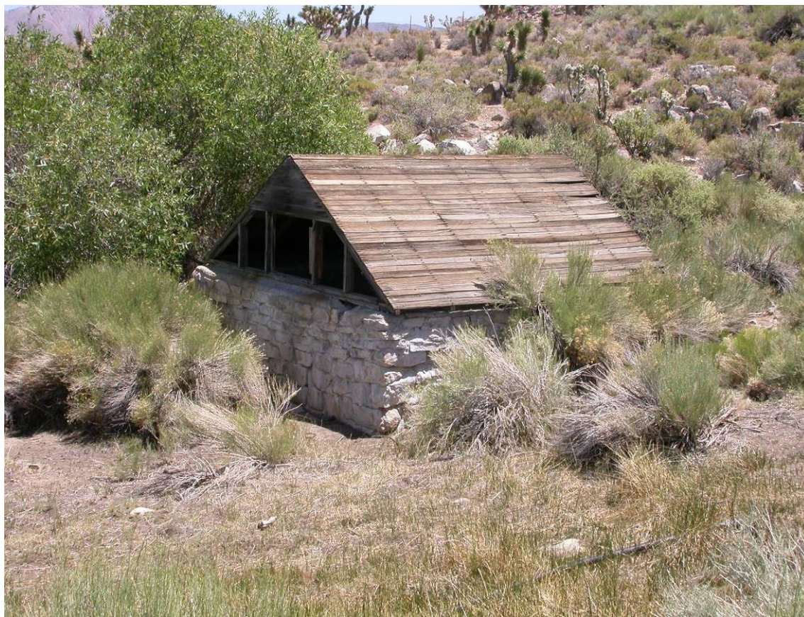
Figure 4-3. Indian Garden Springs Tank #2, view to southeast.