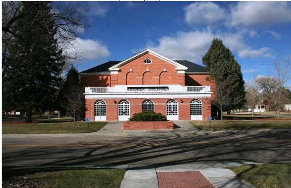
Base Theatre, Building 150, view to west