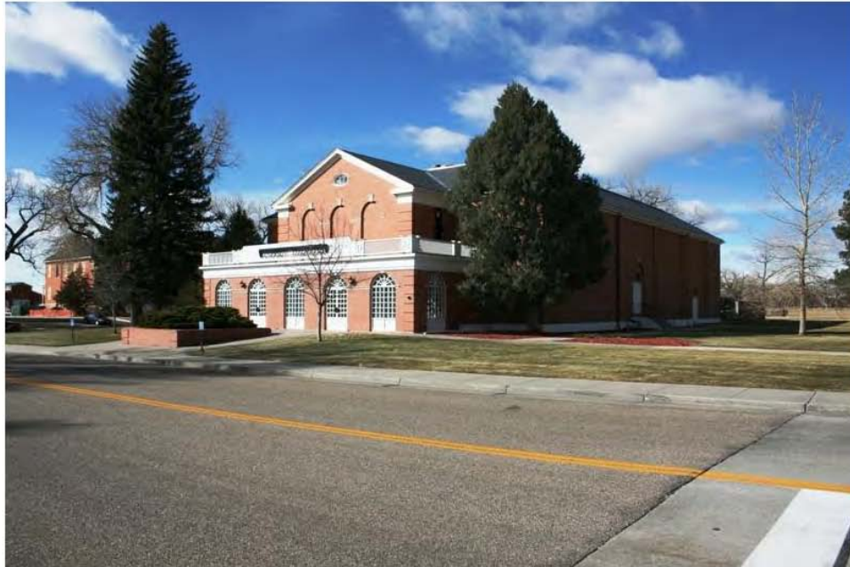
Base Theatre, Building 150, view to southwest