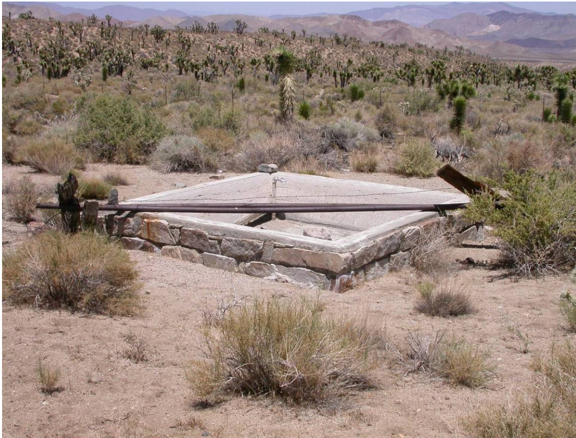
Figure 4-2. Indian Garden Springs Tank #1, view to north.

The Indian Garden Springs site consists of two masonry stock water tanks, the first measuring 9x9x2 ft while the second is 10x10x5 ft. Both tanks were made with locally quarried stone and the second tank has a wood framed gable covering the open top tank reservoir. It is unclear if this covering was constructed by the CCC or added later. A round corral is located approximately 120 feet east of tank #2 and 30 feet west of tank #1. The circular corral, measuring approximately 50 ft across, is constructed of milled lumber and railroad ties using a double twisted, double tied barbed wire. Metal and wooden troughs, water pipes, glass fragments, metal cans, and flaked stone debitage were also recorded at the site. There are remnants of barbed wire fence on the north side of the site. The Indian Garden Springs stock tanks were constructed by the CCC from 1-29 November 1939. A CCC camp, the Darwin side camp, was located at the Indian Garden Springs site. The stock tank also served as water storage for the camp. A cement slab foundation on the north side of the spring is reported to be all that is left of the camp. The foundation was not relocated. This site is evaluated here as locally significant under criterion A for its association with the CCC and criterion D as it may yield information about the Darwin side camp. The site has retained its historic integrity, and is recommended here as eligible for NRHP listing.