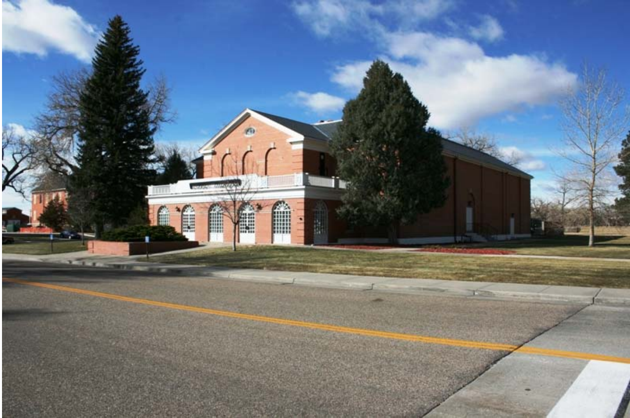
Figure 4-1. Warren Theatre, Building 150, view to southwest