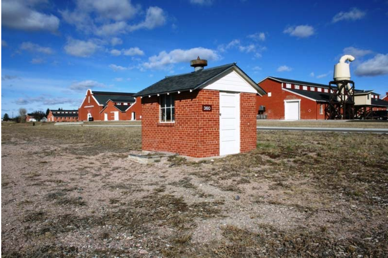
Figure 4-5. Gas Valve Facility, Building 360, view to northwest