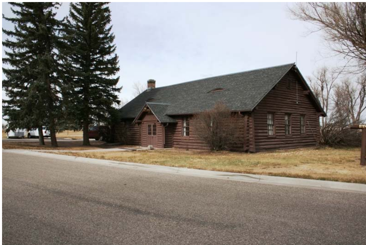
Figure 4-4. Boy Scout Lodge, Building 153, view to northwest