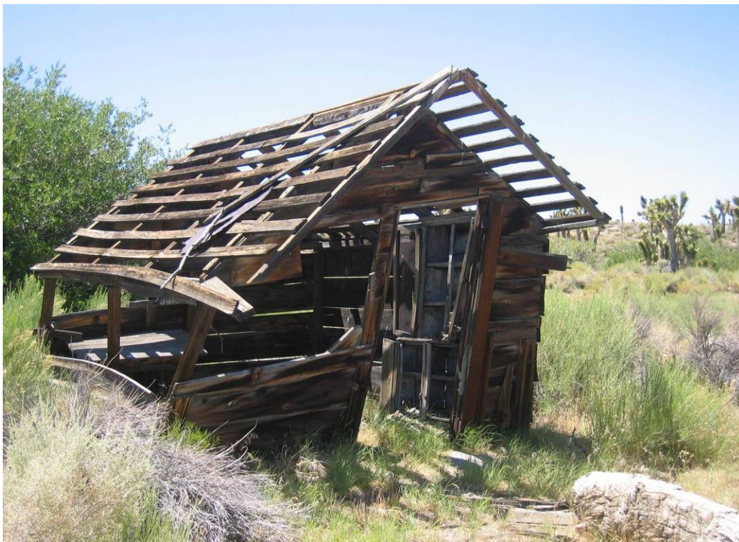
Figure 4-5. China Garden Springs wooden structure, view to west.