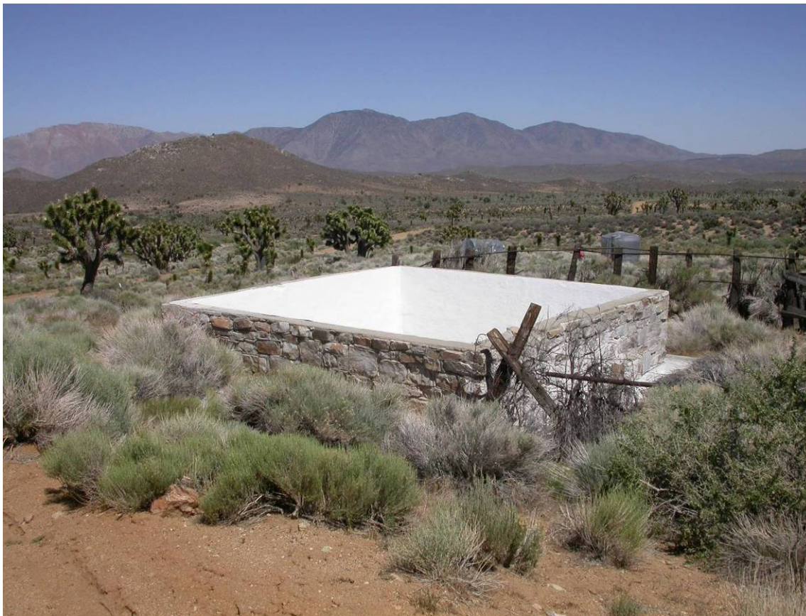
Figure 4-6. Cole Springs Tank, view to east.

The Cole Springs site consists of a masonry stock water tank measuring 18x18x6 ft. The tank was made with locally quarried stone. The tank serves as the northeast corner of a wooden holding pen. The pen measures approximately 50x50 ft and is constructed of milled lumber, railroad ties, metal stakes using a double twisted, double tied barbed wire. A loading chute is located on the south side of the holding pen. A large corral that measures approximately 150x200 ft is located approximately 80ft southeast of the stock tank. This corral has the same construction as the holding pen. It is possible that the corral is associated with Joe Ward, who had mining claims in the area. He had claimed all water and surface privileges including the corral (Kaldenberg 2009). An arrester and cabin are also located at the site but associated with earlier mining. An earthen overflow reservoir is located 60 ft to the northeast of the tank. In addition, metal and wooden troughs, water pipes, metal cans, metal stoves, and flaked stone debitage were recorded at the site. The Cole Springs stock tank was constructed by the CCC from 3-16 April 1941. This site is evaluated here as locally significant under criterion A for its association with the CCC. It has retained integrity, and is recommended here as eligible for NRHP listing.