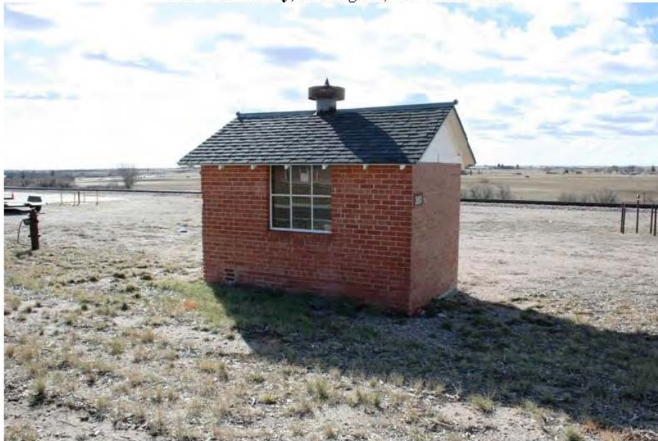
Gas Valve Facility, Building 360, view to south southeast