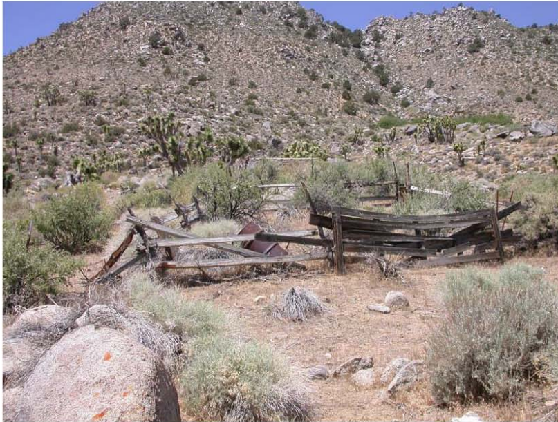
Photo 2. Corral at Crystal Spring.