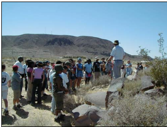
Classroom tour of rock petroglyphs at USMC Logistics Base, Barstow, CA

The National Historic Preservation Act (NHPA), various Executive Orders and agency guidelines charge federal agencies with managing historic properties under their stewardship to benefit and inspire the public and to promote community and economic development. Increasingly, the Department of Defense (DoD) has undertaken and sought creative projects that involve public interpretation and outreach of cultural resources as a means of making management and compliance efforts more meaningful. By proactively implementing these projects DoD can fulfill other public benefit mandates and foster positive relationships with the public and outside organizations.