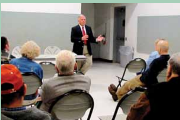
Rep. Green speaks with constituents about federal legislation and initiatives in Congress at a Town Hall Meeting in the 29th District.

Congress of the United States House of Representatives Washington, D.C. 20515