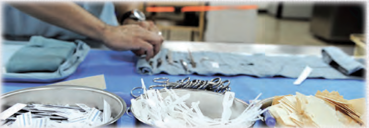
A Navy hospital corpsman rolls surgical tools for sterilization aboard the hospital ship USNS Comfort. Medical and surgical items are among the supplies DLA provides to the Comfort and its sister ship, the USNS Mercy, which are often called up at a moment's notice to support U.S. forces or humanitarian assistance missions.