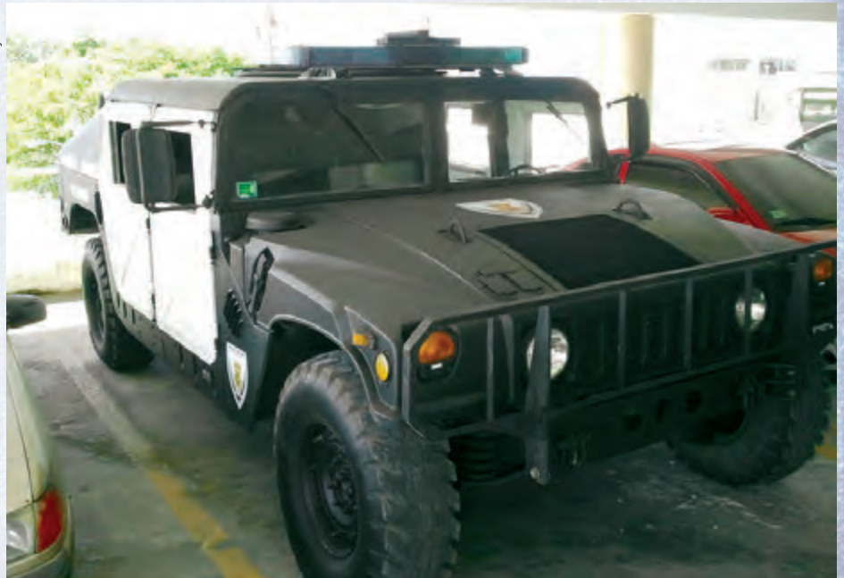
Officers in the Isabela, Puerto Rico, Police Department use this Humvee for beach patrols and to visit hard-to-reach jungle sites where illegal narcotics operations thrive.