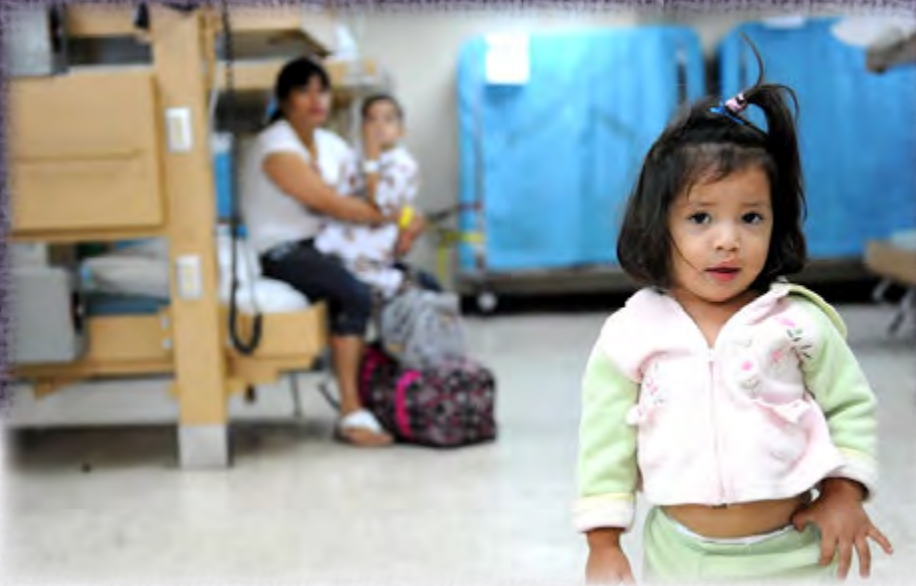
A child poses for a photograph aboard the Military Sealift Command hospital ship USNS Comfort before surgery to repair her cleft lip during Continuing Promise 2011 in Manta, Ecuador. DLA ensures surgeons aboard the ship have what they need to perform such operations.

exactly what they need no matter where they operate.