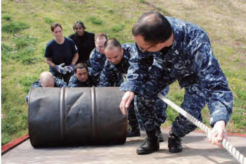
Sailors from the DLA Joint Reserve Force maneuver a barrel over an obstacle as part of a leadership reaction course during the 2011 Joint Reserve Training Readiness Exercise at Fort Eustis, Va.