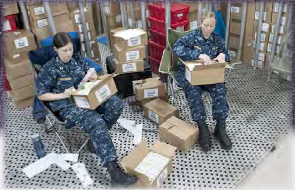
Two Sailors open boxes of medication in the pharmacy aboard the hospital ship USNS Comfort in the Pacific Ocean. Pharmaceutical supplies for the Comfort are included as part of DLA's regular prime vendor program, but DLA Troop Support also has contingency contracts in place to cover unexpected missions or changing requirements.

with the technological advancements inherent in today's medical practices.