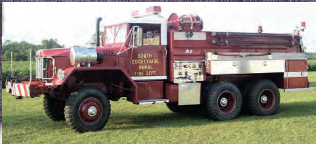
Members of North Carolina's South Edgecombe Rural Fire Department built the above fire truck by combining an existing fire truck with a 5-ton Army truck the department received from DLA Disposition Services. Volunteers spent nearly 700 hours outfitting the truck with 125 hose and pipe fittings, 350 feet of wire, 75 light bulbs and nine gallons of paint. Images to the left show various stages of construction.

fresh from an assembly line would cost. Chatfield's fire department is like those of most rural areas: poorly funded and desperate for proper equipment.