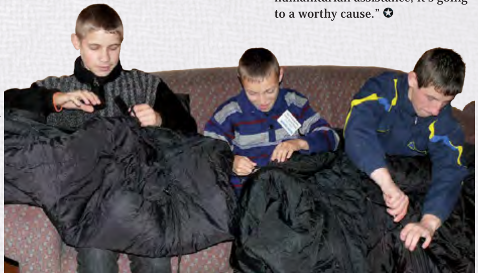
Boys at an orphanage in Moldova check out the new sleeping bags they received with the help of DLA Disposition Services and the Humanitarian Assistance Program.