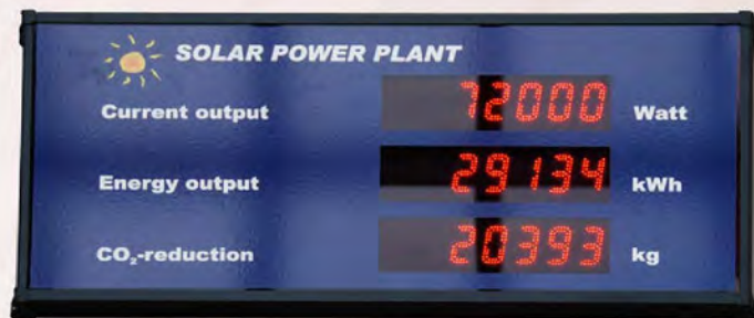
The new Logistics Distribution Center Europe will feature energy-efficient amenities including skylights, solar panels and heat-ambient floors that are warmed by hot water flowing through tubes in the concrete.

"We just took a common-sense approach with the team's learning and understanding so that we'll have fewer limitations in the new facility and just the right mix of automation and human touch. In the walk-and-pick area, for example,