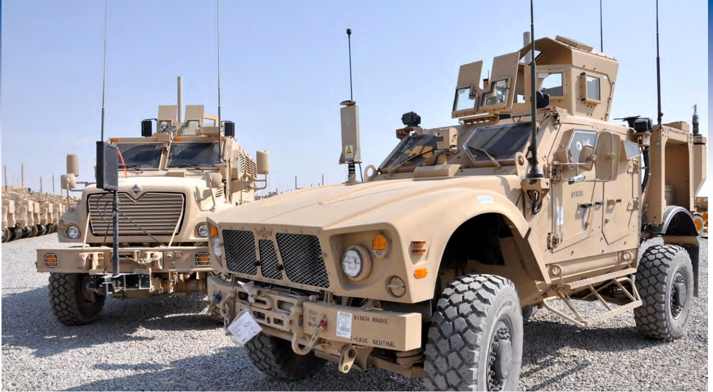
Mine Resistant Ambush Protected vehicles await pickup in Kandahar, Afghanistan. The Office of Internal Review at DLA Land and Maritime helped ensure the more than $1.4 billion in MRAP funding the primary-level field activity handles was managed well.

more than $1.4 billion in funds from the military services for Mine Resistant Ambush Protected vehicles, he turned to his Office of Internal Review.