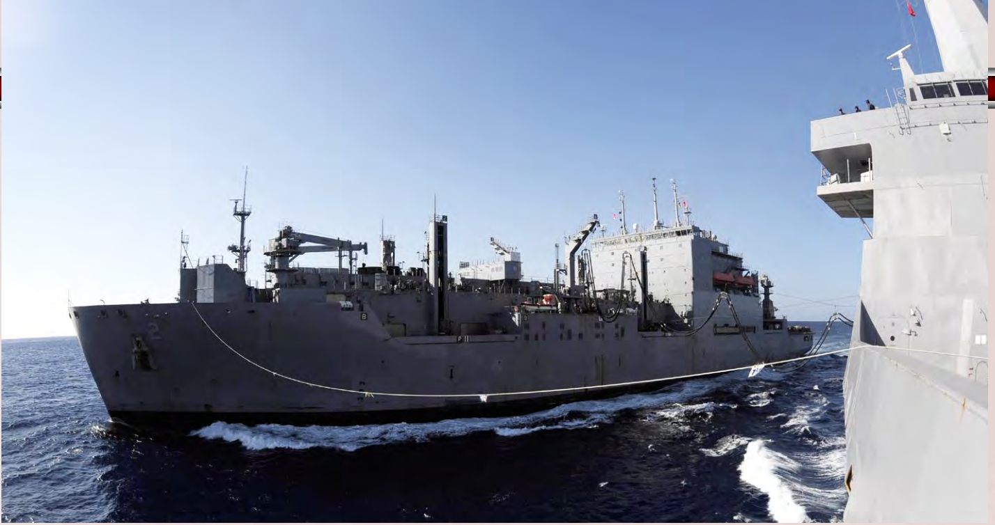
The Military Sealift Command dry cargo and ammunition ship USNS Sacagawea (left) and the amphibious transport dock ship USS Mesa Verde conduct an underway replenishment in the Mediterranean Sea during Operation Unified Protector. DLA Energy provided 209 million gallons of fuel products to U.S. forces during the operation.