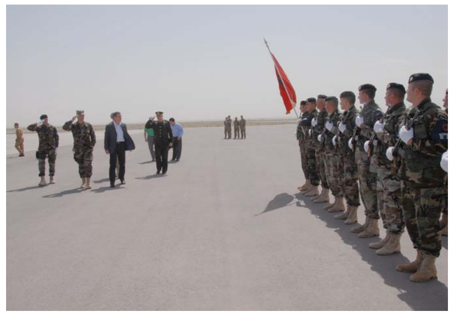
Honor Guard in occasion of arrival of the Minister of Defense.

Minister of Defense concluded his speech by saying: "Lastly I would like to assure you that you have my support needed to carry out the mission for peoples' freedom successfully and with professionalism. Likewise I trust in your support