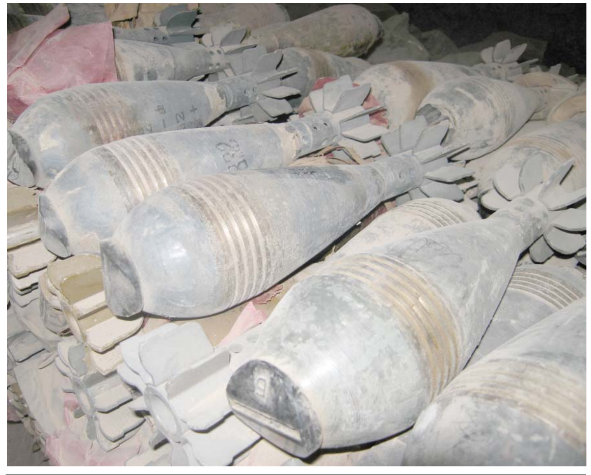
Unboxed high explosive mortar bombs stored at Khairabad depot.

The NATO/PfP Trust Fund mechanism was established in 2001. It is a vehicle to assist NATO's partner nations in the safe destruction of stockpiles of anti-personnel landmines, small arms, and munitions or to help manage the consequences of defence reform. To date, NATO Member and Partner Nations, as well as other nations and international organizations, have pledged more than •38 million to ongoing and completed Trust Fund projects.