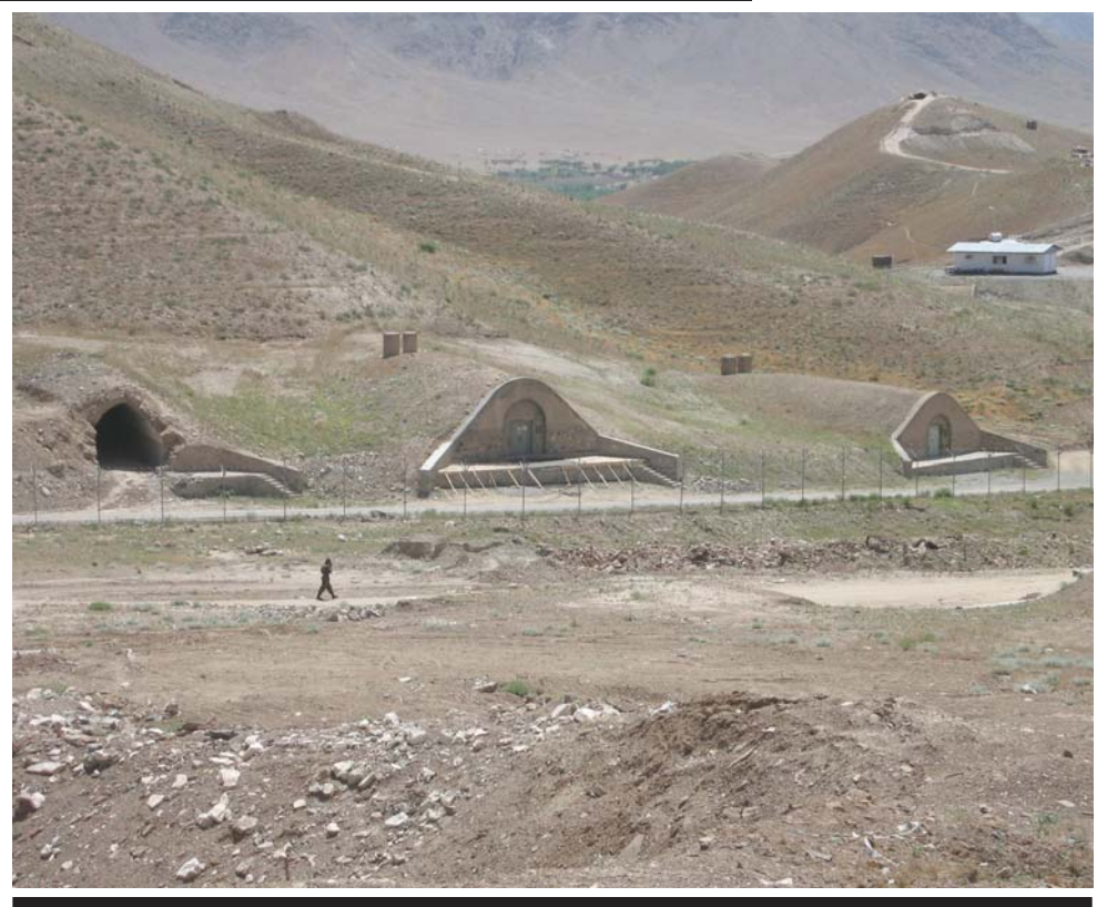
Ammunition storage bunkers at Khairabad, Kabul province

The project will be implemented under the umbrella of NATO's Afghan Cooperation Programme as set out in the September 2006