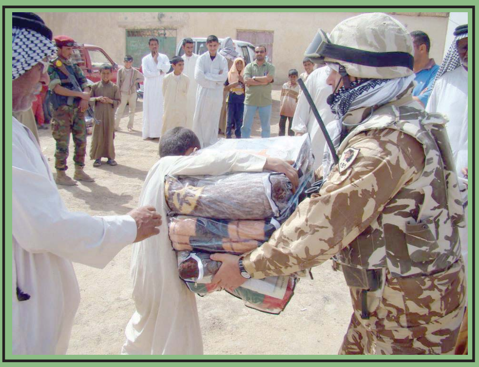
Romanian soldiers of 151st IN BN distribute blankets within CIMIC project - Blankets distribution - mission in AOR.

Bridge over the Euphrates River. Besides this task, the ROU BN conducts several other tasks in order to allow freedom of movement and force protection to the coalition forces on the main and alternate supply routes within the AOR. CIMIC projects are now being brought to attention and their role is increasingly crucial. It is a proven fact that developing a CIMIC project results in good premises for security. The