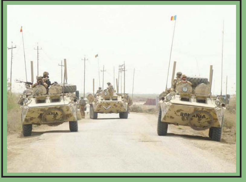
1st Squad from 1st Platoon of the 2nd IN CO of 151st IN BN conducts patrolling in Area of Responsibility of Al Badr.

The 151st IN BN soldiers are keen on their way to mission