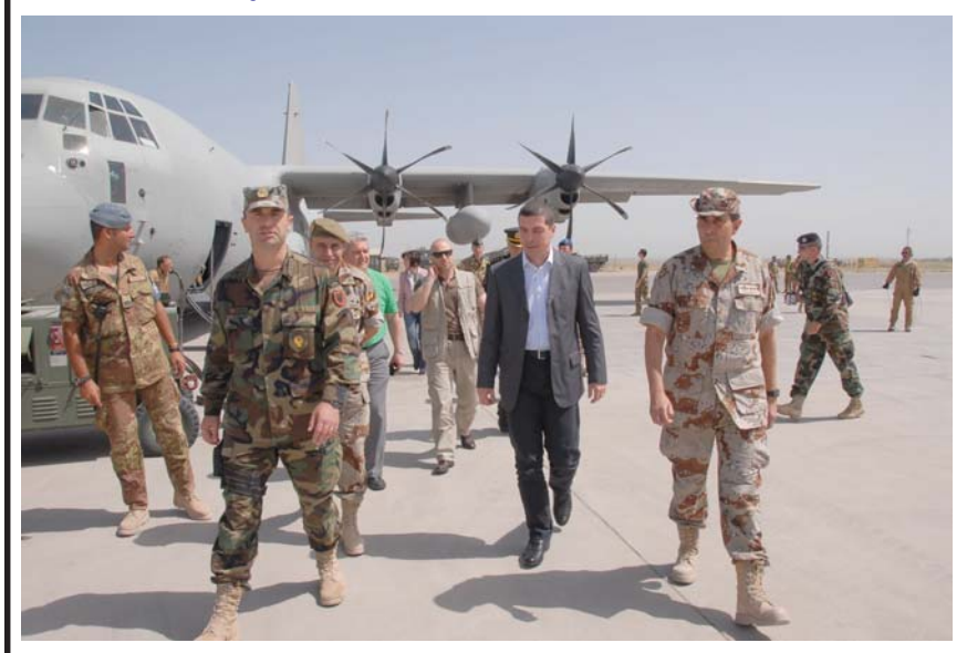
Albanian Minister of Defence greeted in Herat Airport by Albanian Commander of Peace Keeping Contingent Cpt Cera and by the Italian and Spanish Troops Commanders.

Story and photos courtesy of Albanian Ministry of Defense