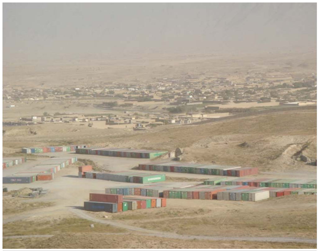
View of the temporary ammunition storage depot at Pol-e-Charkhi, east of Kabul. The proximity of the village is to be noted.

Declaration by NATO and the Islamic Republic of Afghanistan, and is the first such Trust Fund of its kind established under this Declaration. It is a manifestation international solidarity with Afghanistan and the willingness of NATO and the international community to provide concrete assistance to Afghanistan which will strengthen its ability to achieve security and stability.