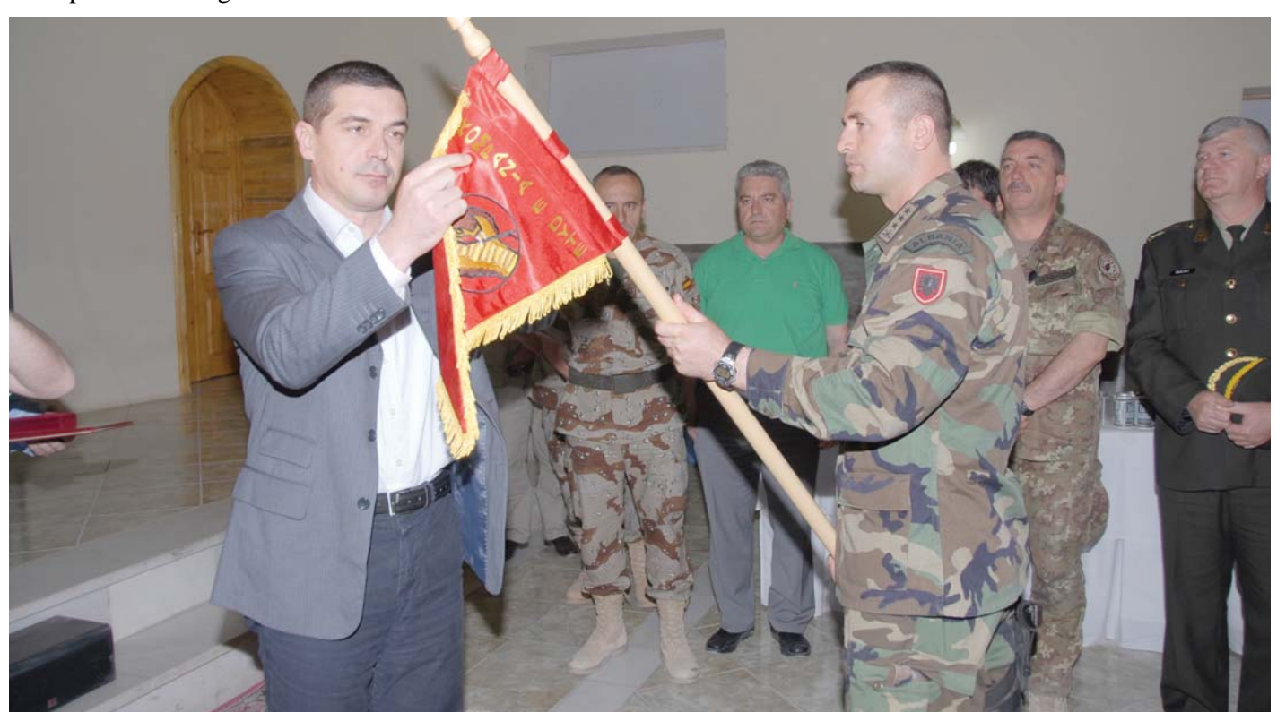
Minister of Defense awards the Medal of Achievement to "Cobra" Company Commander (Albanian Peace Keeping Contingent).

Whereas the 2nd contingent operates in Herat as part of the Italian and Spanish mission and is composed of 113 officers, noncommissioned officers and professional soldiers. The 6th medical team composed of one doctor and three military nurses operates in Kabul.