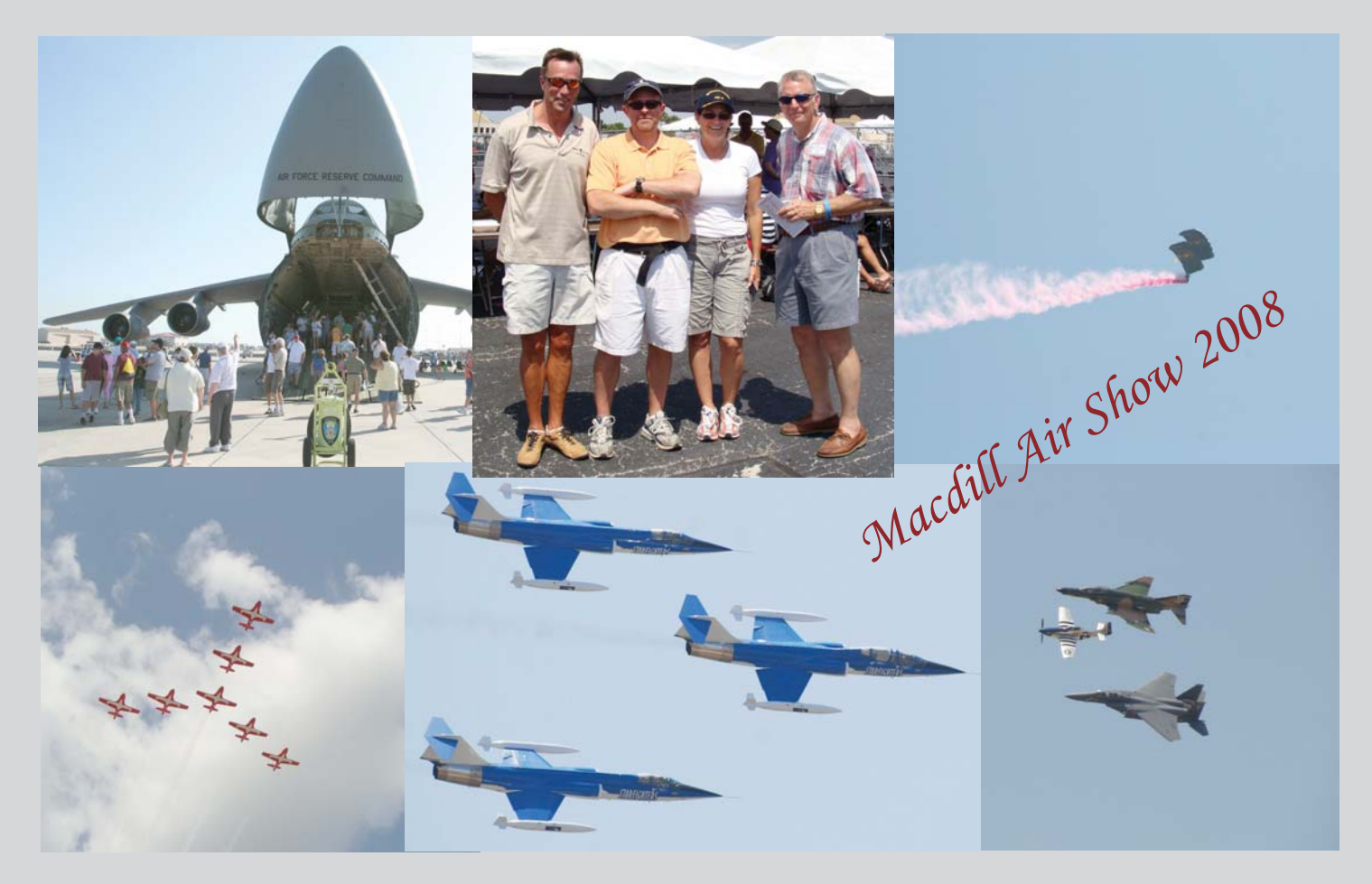
Norwegian National Day