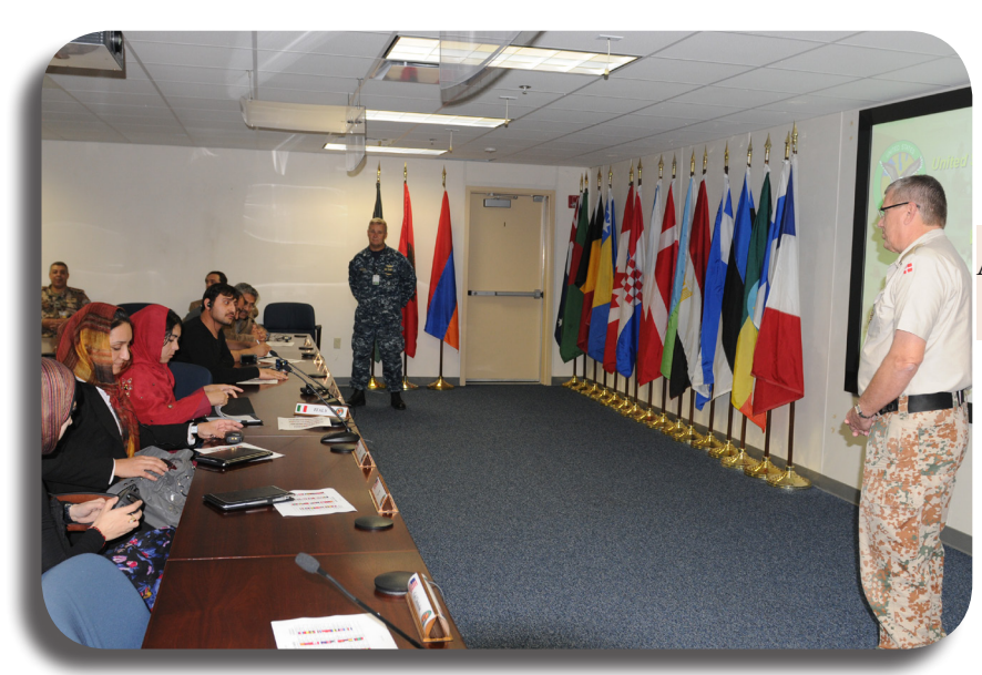
Afghan delegation visit Coalition Village (CV3) at USCENTCOM

Lithuania community of USA sending Christmas Presents to the troops at Afghanistan