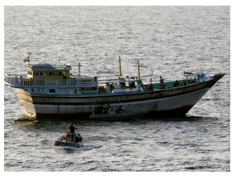
The John C. Stennis Carrier Strike Group is conducting maritime security operations in the U.S. 5th Fleet area of operations while supporting Operation Enduring Freedom.

Piracy is an international problem requiring an international solution and is a threat to all mariners. The presence of U.S. Navy ships in this region promotes freedom of navigation and protects the safety of those who transit the sea.