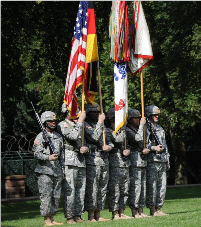
The 21st Theater Sustainment Command Color Guard displays the colors during the 21st TSC Retreat and Retirement ceremony on the Panzer Parade Field in Kaiserslautern, Germany, July 28.