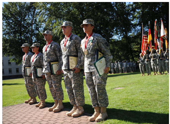
The 21st TSC welcomed its newest members into the Sergeant Morales Club during a special induction and retreat ceremony on the Panzer Parade Field in Kaiserslautern, Germany, Aug. 18.