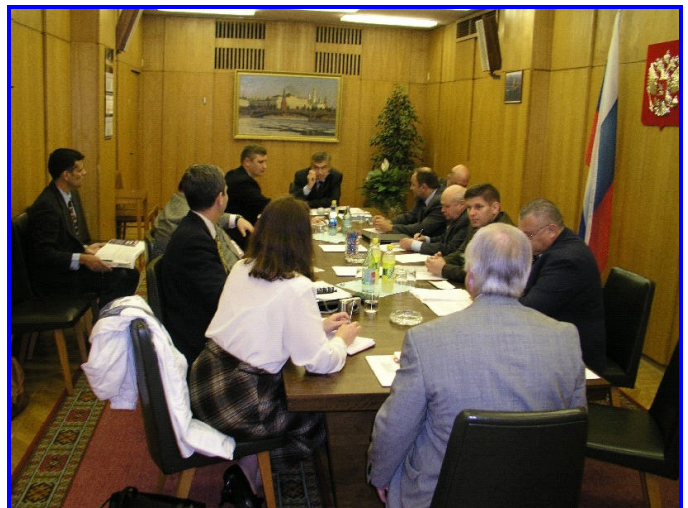
DASD Jennings (foreground), as Chairman of the U.S. - Russia Joint Commission on POW/MIAs, leads the U.S. delegation as talks begin with the Russian side of the Commission in Moscow.

Tentative plans are being made now for the 19 th Plenum of the Joint Commission to take place in Moscow soon after the 60 th anniversary celebrations of World War II.