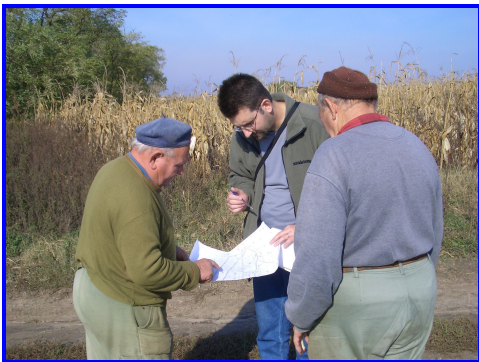
Hungarian villagers pinpoint the location of a possible crash site for DPMO WWII analysts.