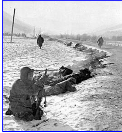
Marines dig in during the Battle of Chosin Reservoir.

As a result of talks between the North Koreans and DPMO in 2001, U.S. recovery teams were allowed on the east side of the Chosin Reservoir where we have conducted recovery operations each year since.