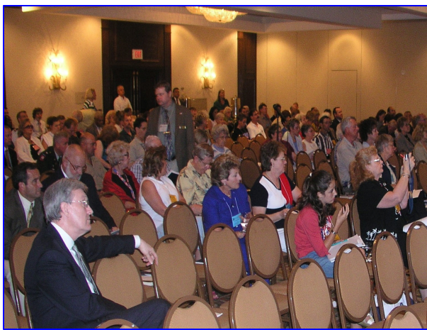
Vietnam War family members at the annual government briefings last year.

DPMO set the date for the government briefings to coincide with the annual meet-