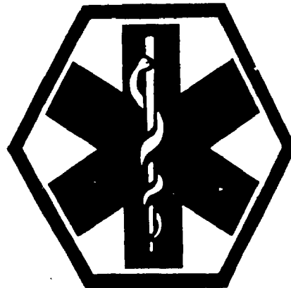
Figure 14-1. DA Label 162 (Emergency Medical Identification Symbol), shown actual size

b. DA Label 162 is a self-adhesive label depicting the "Star of Life" (fig 14-1). It consists of a white serpent on a white staff superimposed on a red star with a white background. DA Label 162 is affixed to the STR, OTR, CEMR, and DD Form 2766 (folder construction only) to assist in the recognition of selected health problems documented within these records. It will be affixed to these records in conjunction with issuance of the Medical Warning Tag.