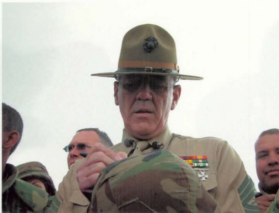
F. Lee Ermey in his drill sergeant persona autographs a helmet during a recent morale visit to Camp Roberts, Calif.

“God bless the troops, God bless the Commander in Chief, and God bless the United States of America.”