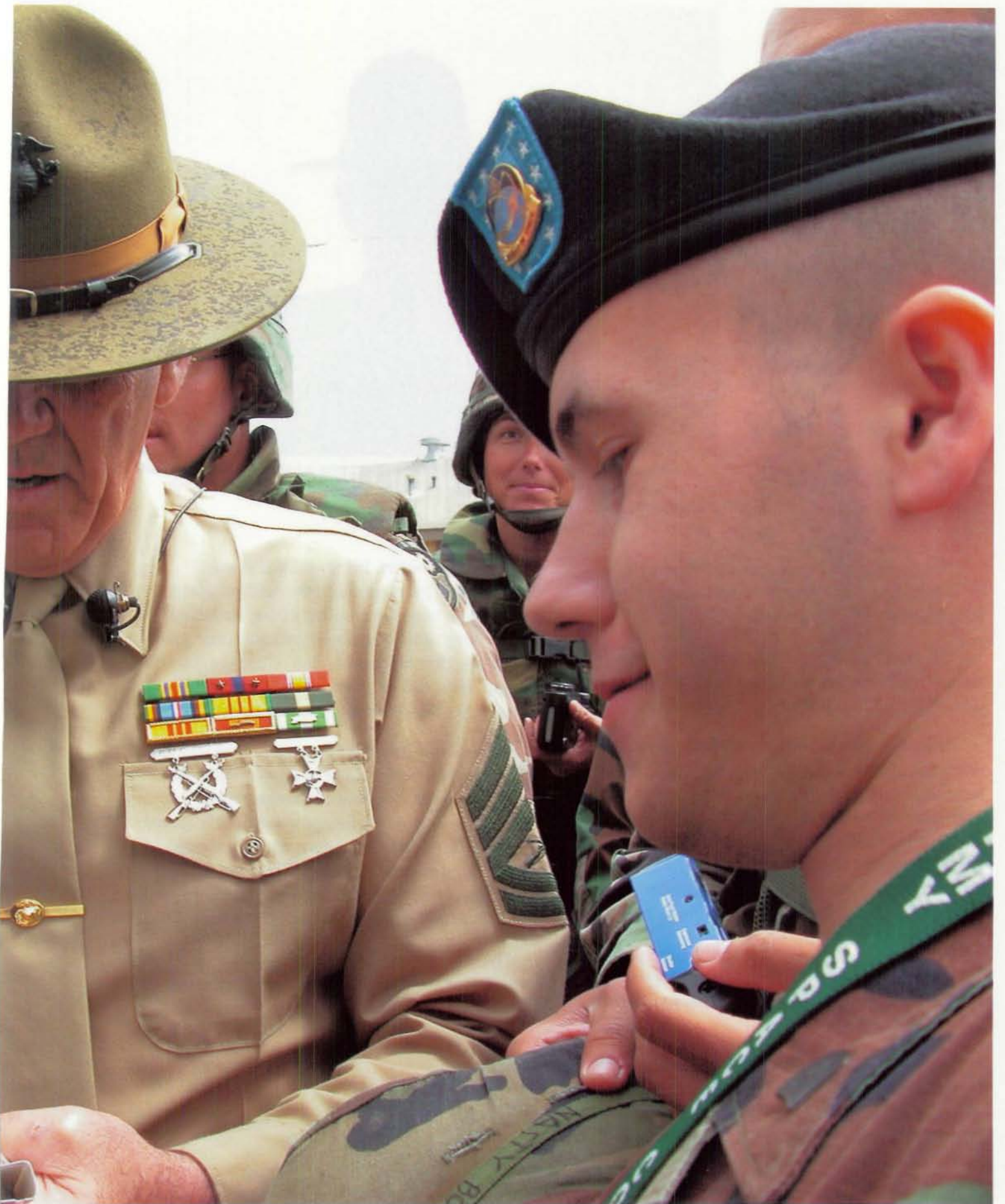
Space Command, gets an autograph from movie star R. Lee Ermey, famed for his portrayal of a drill sergeant in the film Vietnam Vet, spoke to soldiers at Camp Roberts, Calif.