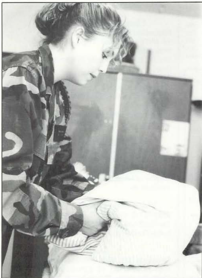
A DLI student living in the dormitory prepares for linen exchange day before class.

It's 5:30 a.m. on any weekday, and the Defense Language Institute Foreign Language Center is springing to life. Army, Navy, Air Force and Marine students are getting ready for yet another day in paradise — or so it would seem. To the outsider, DLIFLC may look like any civilian institution of higher learning. Many know that it specializes in foreign language instruction and that its students are predominately military, but few realize the demands placed on the students here at DLIFLC.