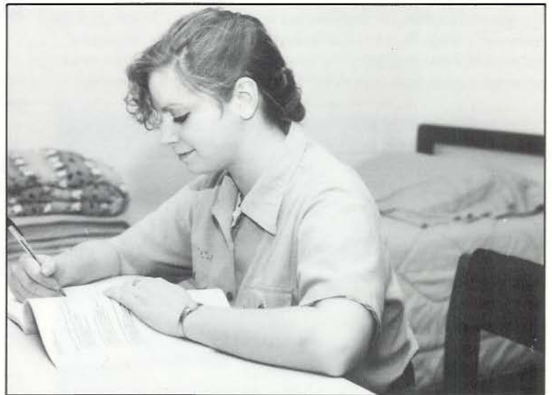
After a long day in class, it’s time to relax — but not for long. DLI students, on the average, spend about two hours a night on homework.

Married or single, everyone needs a break. Though the military occasionally has weekend plans for students, usually it’s time for them to temporarily forget their language studies and just have fun. However, weekends aren’t guaranteed to be free. Students are soldiers, and occasionally have additional duties that infringe on weekend time. These can include weekend inspections,