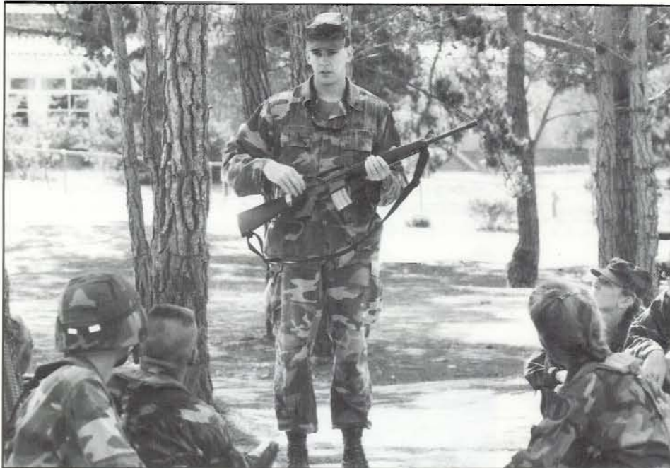
DLI students take part in military training in addition to their language training. Here, a class of Russian and Czech students participate in a Field Training Exercise in which they must utilize their target language.

“fun runs,” community service, Common Skills Training (marksmanship, first aid, land navigation, survival skills) barracks security and so on.