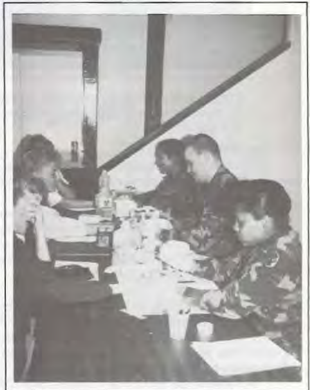
Students from the Middle East and Russian Schools hold out their fingers to Fort Ord medical technicians for the testing of their iron levels during the blood drive March 12 at Lewis Hall gymnasium.