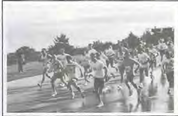
And they're off! Runners, joggers and walkers sprint out from Sloat Monument in the 3rd annual Run with the Dream.

Contestants began arriving at 8:30 a.m. to limber up for the 9 a.m. start of the looped, hilly course. The course followed the Presidio's roads on a winding path up and down, over and around the entire length and width of the base. Many runners found laboring up the hills was arduous, as was maintaining a controlled pace on the downhill to eliminate the risk of shin splints. If anyone wanted to set a personal best in a 10K, this was not the race to try it. It was however, a perfect race and a perfect