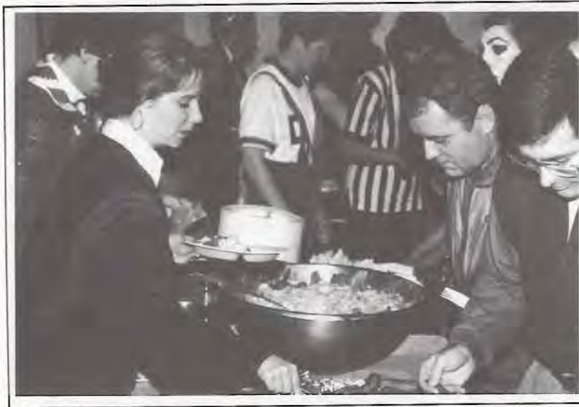
Revelers enjoy sausages, potato salad, rolls, bread and a variety of desserts during the Fasching Ball.

The ball featured an authentic German band, German food, skits, singalongs, and prizes -- donated by local businesses -- for the best costumes. Besides traditional alpine-style dress, costumes represented modern German tourists, a geisha girl, Dracula, a Rastafarian, Renaissance maidens, a Portuguese senorita, a French dance-hall girl, flower children, Groucho, a leprechaun, cowboys and even satellites. Some of the most interesting costumes were hard to figure out.