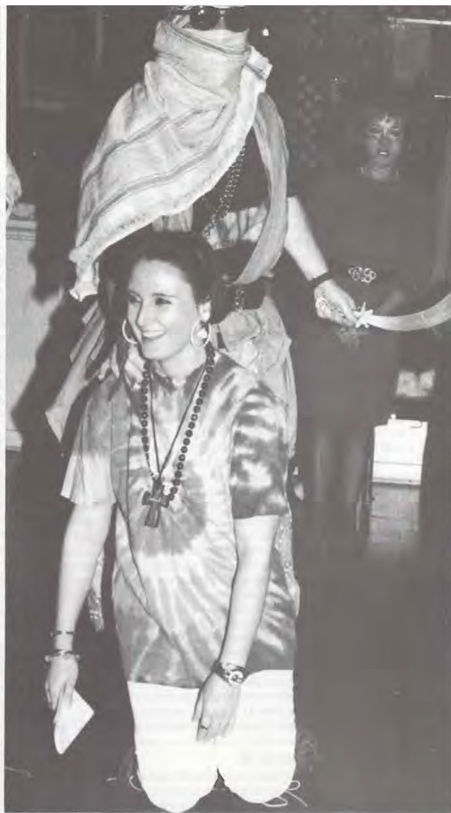
Contestants added a little stage acting in the best costume contest, hoping to garner more votes. Additional points just might cost the slave girl (above) her head.