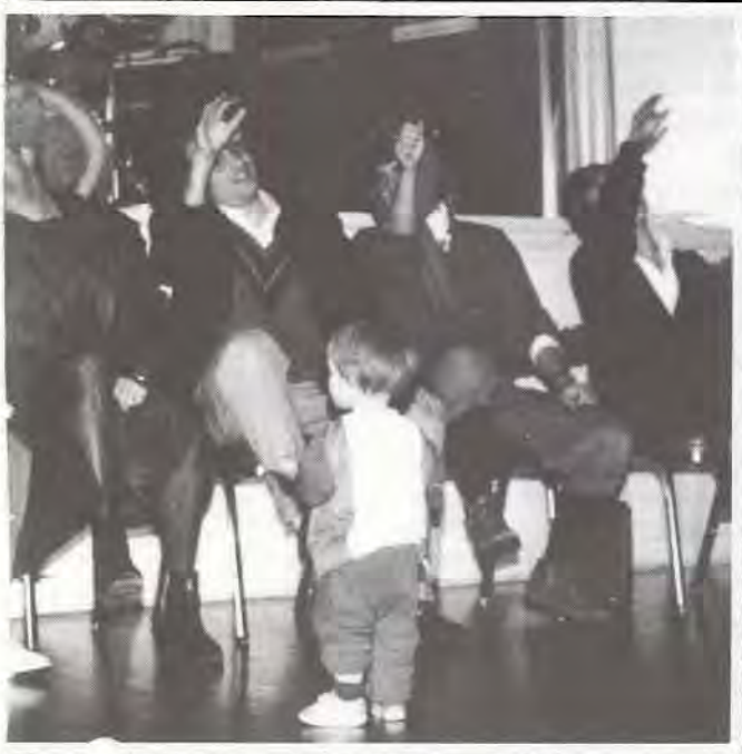
They act out their parts in a skit during the DLI Fasching

Even those who didn't understand German found no barrier to understanding the language of good, old-fashioned fun.