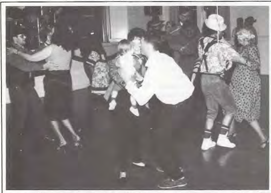
Live music gives revelers the chance to take to the dance floor for a mixture of German dancing and impromptu stepping.