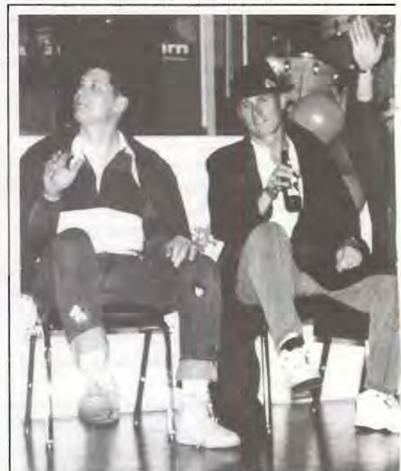
German Department students enthusiastically attend Fasching Ball Feb. 26.