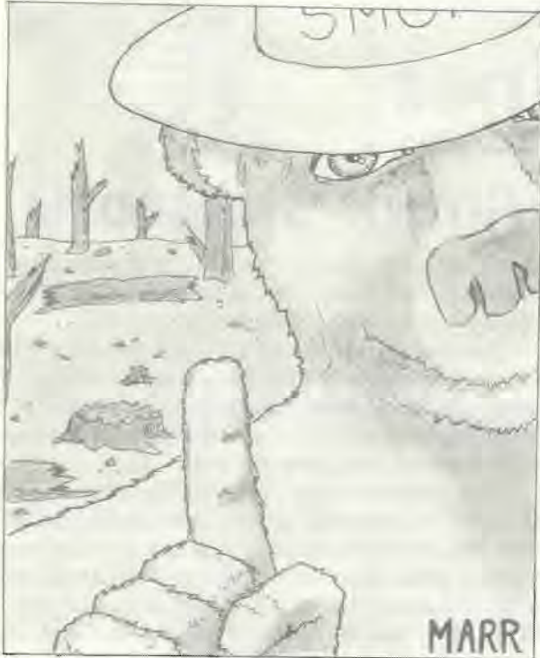
Don't let forest fires happen