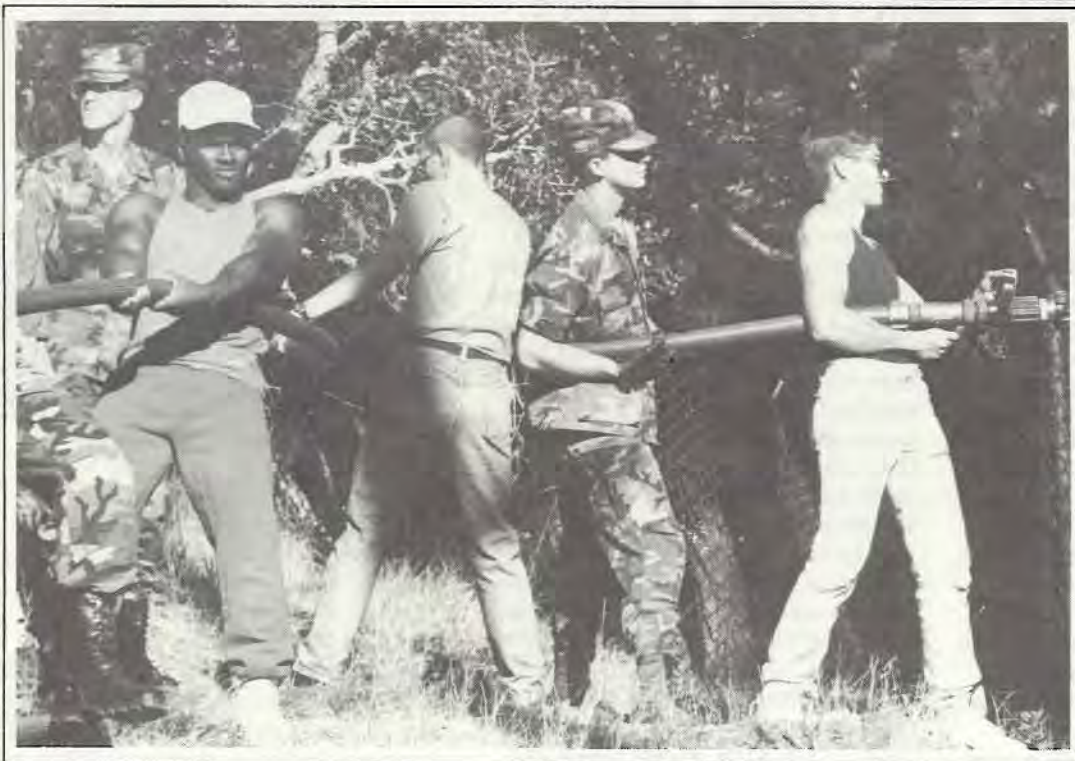
Service members at the Defense Language Institute man the hose to prevent re-sparking after the fire at Huckleberry Hill Oct. 8.