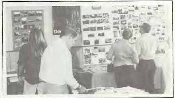
The Central European School lobby was filled with paraphernalia for Reunification ceremony visitors to view.