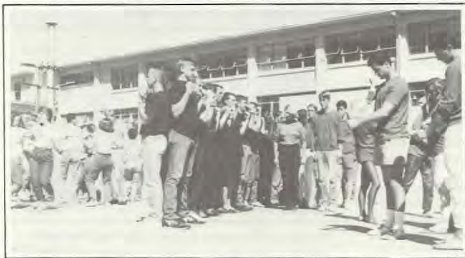
German students on the left represent joyous West Germans while those on the right represent stoic East Germans during the symbolic dance held at the Reunification ceremony.