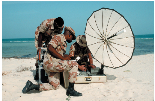
Figure 28: The U.S. military uses commercial satellite communications to support its missions.

• In 1991, the U.S. military procured commercial remote sensing imagery from a non-U.S. company during Desert Storm. Commercial satellite communications services were critical to U.S. Army missions.