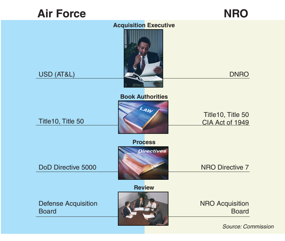
Figure: 24 Acquisition Oversight in the Air Force and the NRO