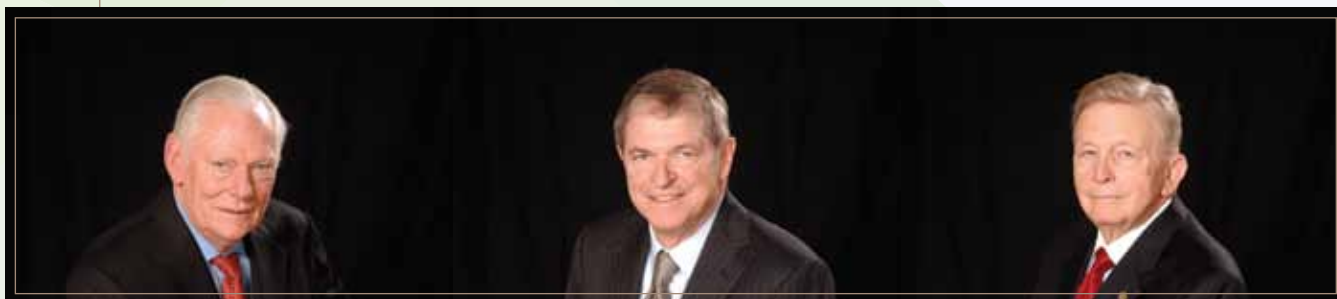
Herbert D. Kelleher (Chairman) Founder and Chairman Emeritus, Southwest Airlines Co.