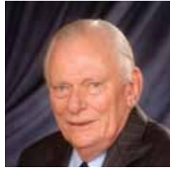
Herbert D. Kelleher (Deputy Chairman) Founder and Chairman Emeritus, Southwest Airlines Co.