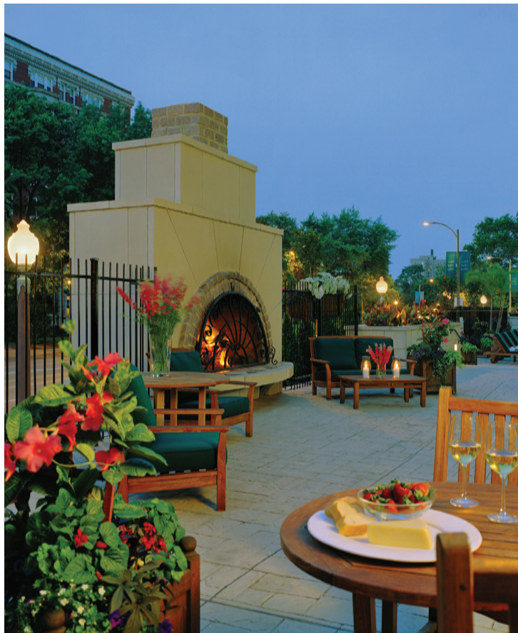
The terrace next to the pool at the Chase Park Plaza.

will take us to important centers of creativity encompassing art, social enterprise, biotechnology and entrepreneurship. It is being presented with The Pulitzer Foundation for the Arts ( www.pulitzerarts.org ). Watch the Exploring Innovation web site ( www.stlouisfed.org/community/innovation ) for details.