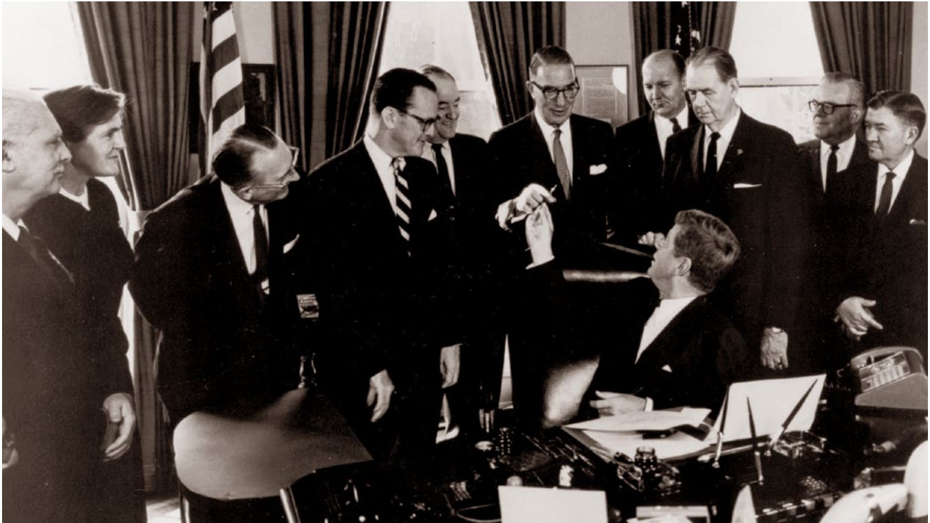
President John F. Kennedy hands Sen. Estes Kefauver the pen he used to sign the 1962 Amendments to the Federal Food, Drug and Cosmetic (FD&C) Act. Those looking on include Frances Kelsey, second from left, the FDA medical officer who refused to approve the new drug application for Kevadon, the brand name for thalidomide in the United States.

F ifty years ago, landmark legislation was signed into law by President John F. Kennedy that established the scientific safeguards used today by the Food and Drug Administration (FDA) to ensure that consumers will not be the victims of unsafe and ineffective medications.