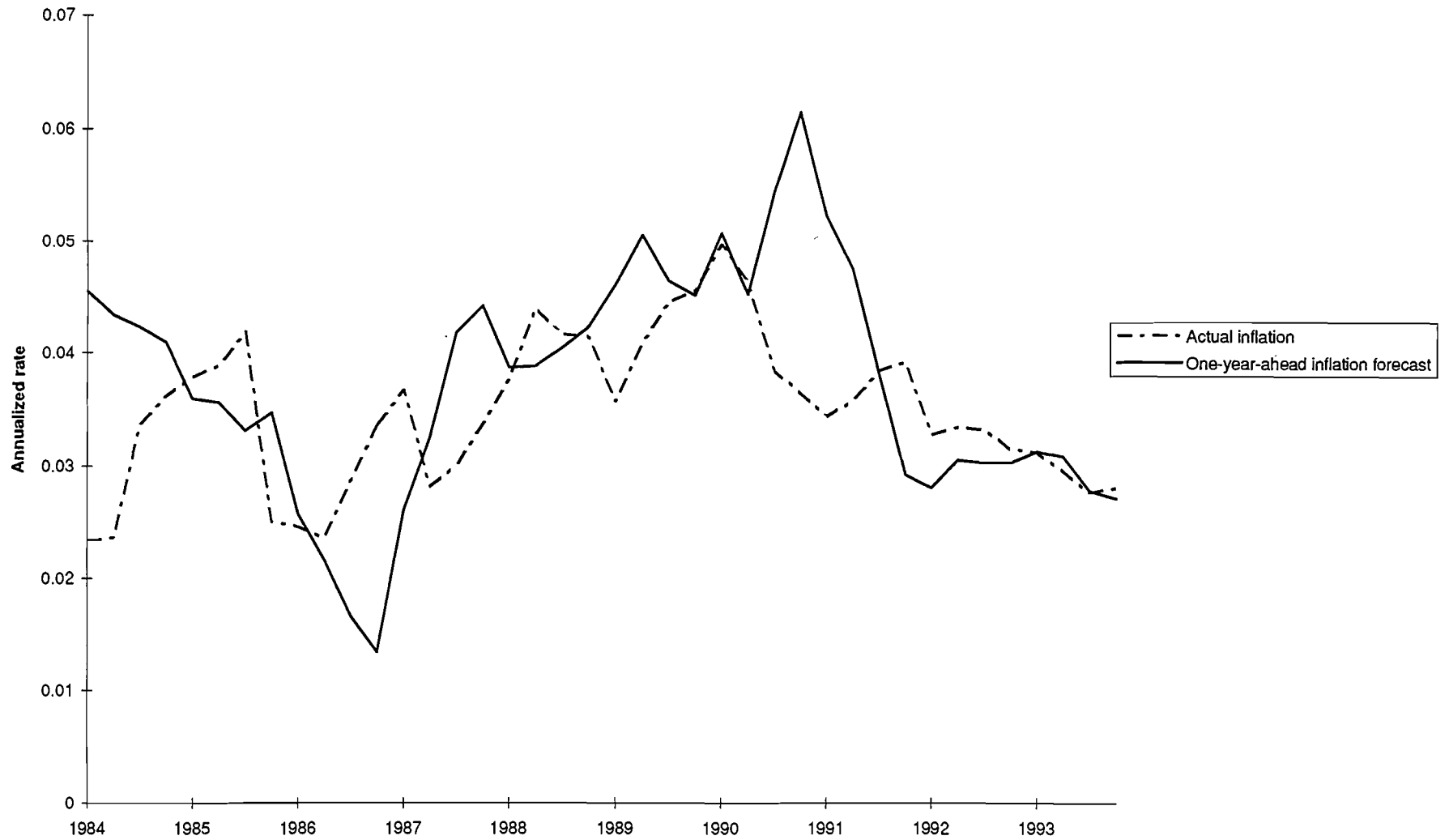
Figure 3: One-Year-Ahead Inflation Forecast

Note: The CGE model is calculated using a four-quarter moving average for the interest-rate trend.