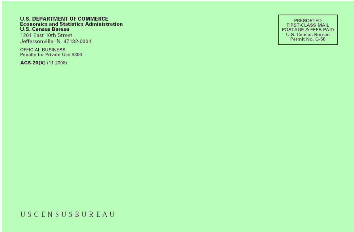
Figure 1. Postcard