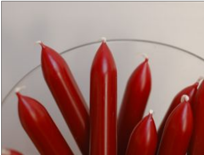
Petroleum wax candles are subject to AD/CVD

CBP is committed to ensuring that the AD/CVD laws are enforced and that those who would try to evade those laws are identified and dealt with appropriately. CBP helps domestic industries by leveling the playing field against unfair foreign competition. CBP is proactively combating AD/CVD evasion by using resources from the entire agency to address this serious problem.