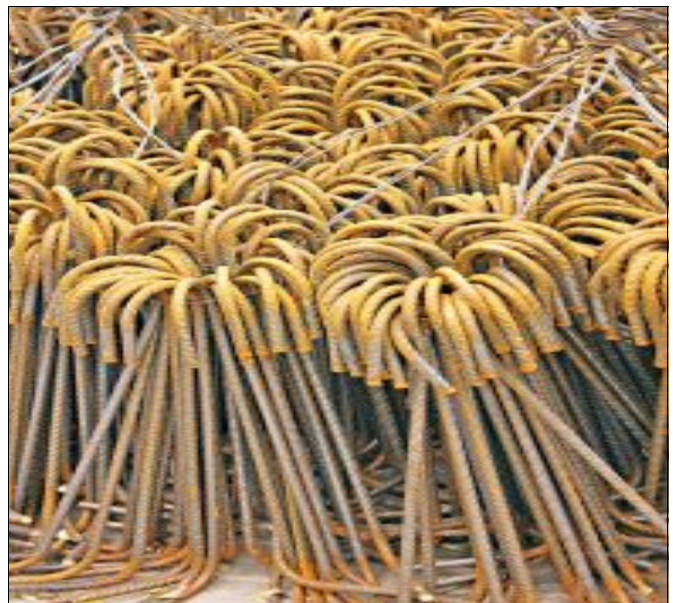
Concrete Reinforcing Bar (Rebar) is subject to AD/CVD

The RED team is also continuing work on other high-priority areas, such as validating claims of transshipment through production verification teams, and determining the best ways to ensure that importers of merchandise subject to AD/CVD have the right to make entry. The RED team is expanding industry outreach and jointly working with the newly formed AD/CVD subcommittee of the Advisory Committee on Commercial Operations of Customs and Border Protection (COAC). The COAC has recommended that a prospective AD/CVD system be established to allow CBP to focus more resources on AD/CVD enforcement.