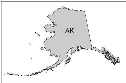
Figure 2. Numeric Change in Resident Population for the 50 States, the District of Columbia, and Puerto Rico: 1990 to 2000