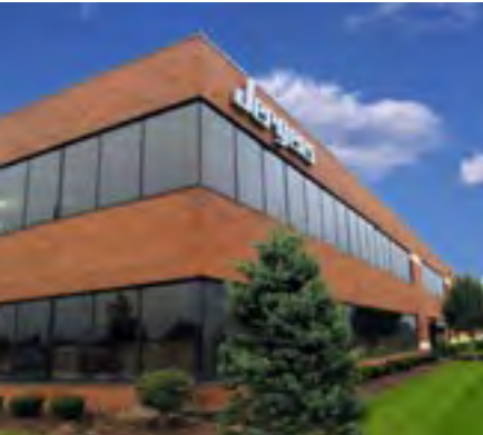
The new Jergens Inc. facility at the abandoned Collinwood Rail Yard site.

For instance, when Cleveland-based tooling components manufacturer Jergens Inc. went looking for a new home for its 150-employee operation, it found an opportunity to make a difference in the city's east-side Collinwood neighborhood.