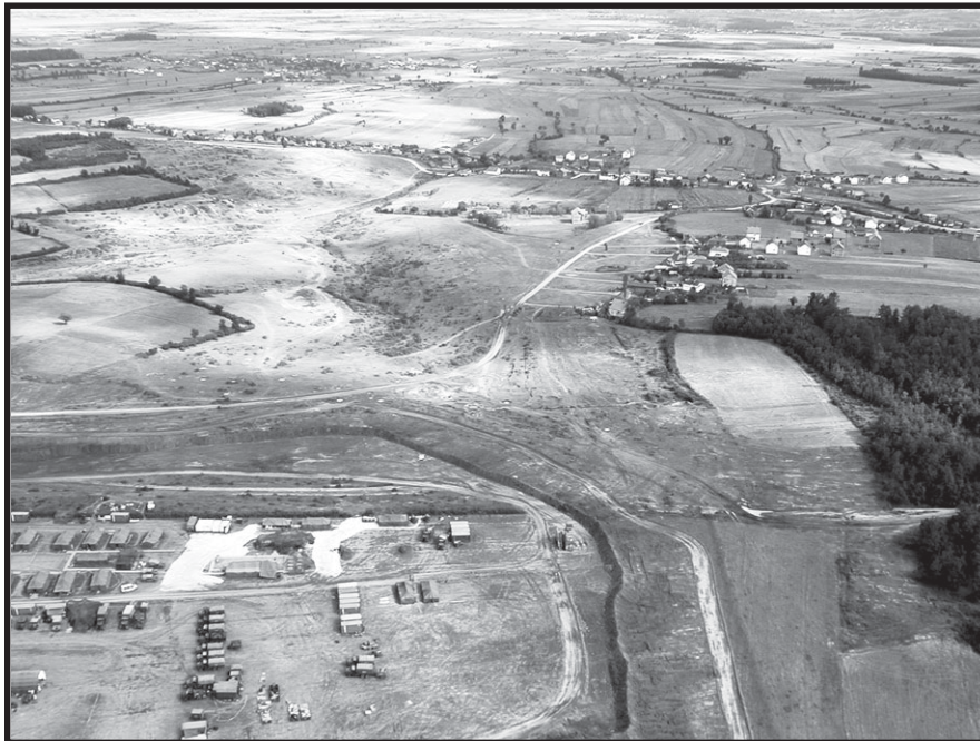
Advanced technologies will reduce site preparation time and logistics requirements, enabling support elements to keep pace with maneuver units.