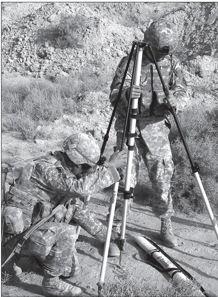
Personnel from the 243d Construction Management Team set up a surveying beacon near Patrol Base Dragon in Iraq.

Further, engineer leaders at all levels are being asked to provide oversight and assistance for the life support of our Soldiers through base camp and life support construction. The mission of quickly establishing and maintaining safe and secure contingency operating locations of all sizes is a task that is dumped into the engineer's lap in our current contingency operation. Facilities engineering skills—to include environmental assessments, master planning, life-cycle costing, and maintenance oversight—are skills that have not been stressed in our professional force. Because of the overwhelming use of and need for these skills as we continue the War on Terrorism, the United States Army Engineer School (USAES) should develop a cell that can ensure the development and maintenance of certain core competencies that our engineer leaders need to meet the challenges of this war.