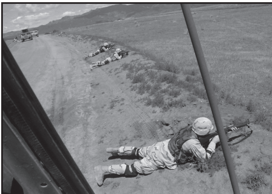
The combat patrol live-fire exercise allows Air Force leaders to plan a combat mission while Airmen test their ability to engage enemy targets in open and urban terrain.

Next, JSTO Airmen tackle the lethality phase of the course, conducting premarksmanship instruction followed by range qualification for individual and crew-served weapons. Army rifle marksmanship is always a new experience for Airmen,